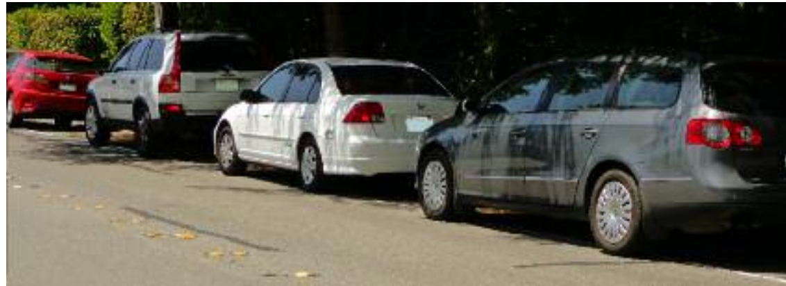
Cars queue up along Happy Valley Road