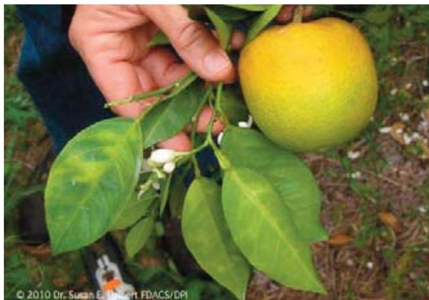
Asymmetrical yellow mottling of leaves and odd shape and greening of fruit, symptoms of Huanglongbing (citrus greening).