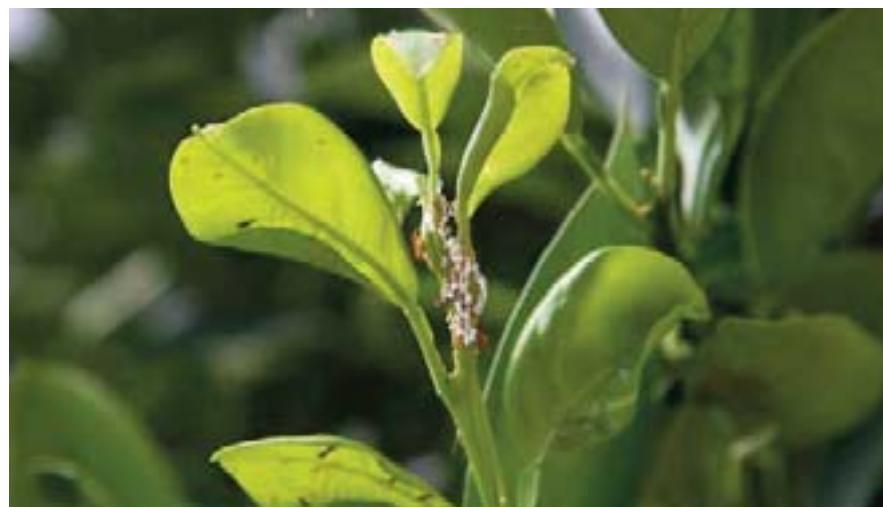
Nymphs and white waxy tubules of Asian citrus psyllid, Diaphorina citri Kuwayama, infesting citrus and being tended by ants.

To obtain state approved citrus budwood for graft, go to http://ccpp.ucr.edu/ or http://www.agmrc.org/commodities__products/fruits/citrus/citrus-profile/ .