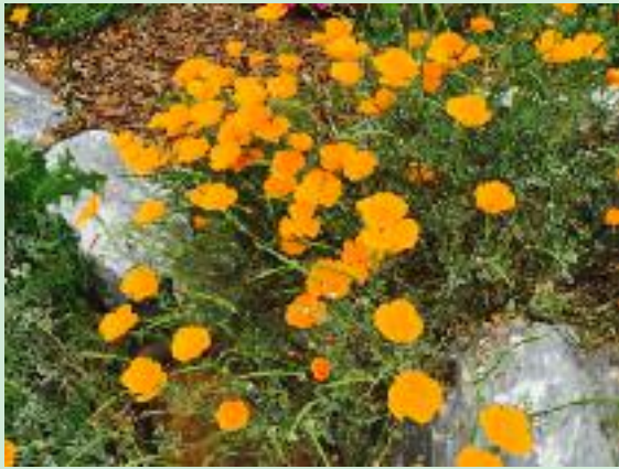
California poppies brighten a rock garden.

PINCH seedlings on annuals to encourage branching and lush, fuller growth patterns.