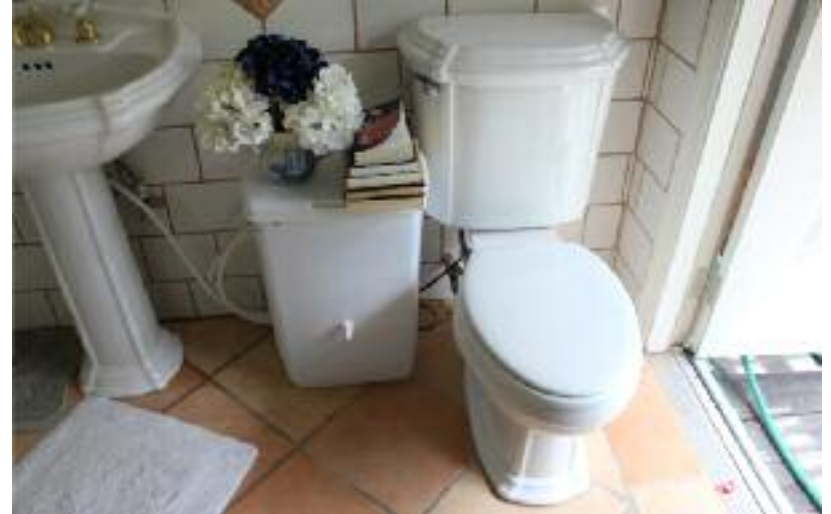
One, two, three: Sink, shower reservoir, toilet. The reservoir has a spigot at the bottom for filling other receptacles.