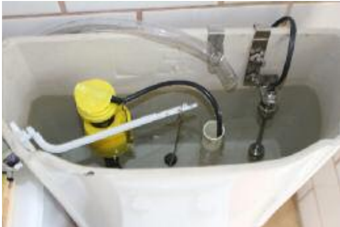
The clear plastic hose at the top of the toilet tank comes from the reservoir of cold shower water that is stored, rather than drained, from the shower.