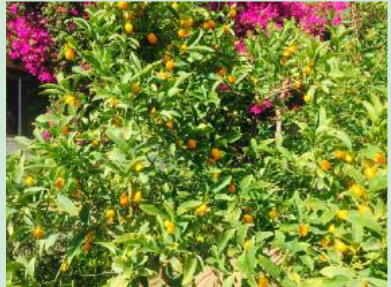
Cumquat trees are the perfect size for picking the small ripe treats.

SOAK your big trees, such as magnolias, with a deep soaker hose. If leaves are yellowing and curling, the tree is thirsty and wants a very long, deep drink.