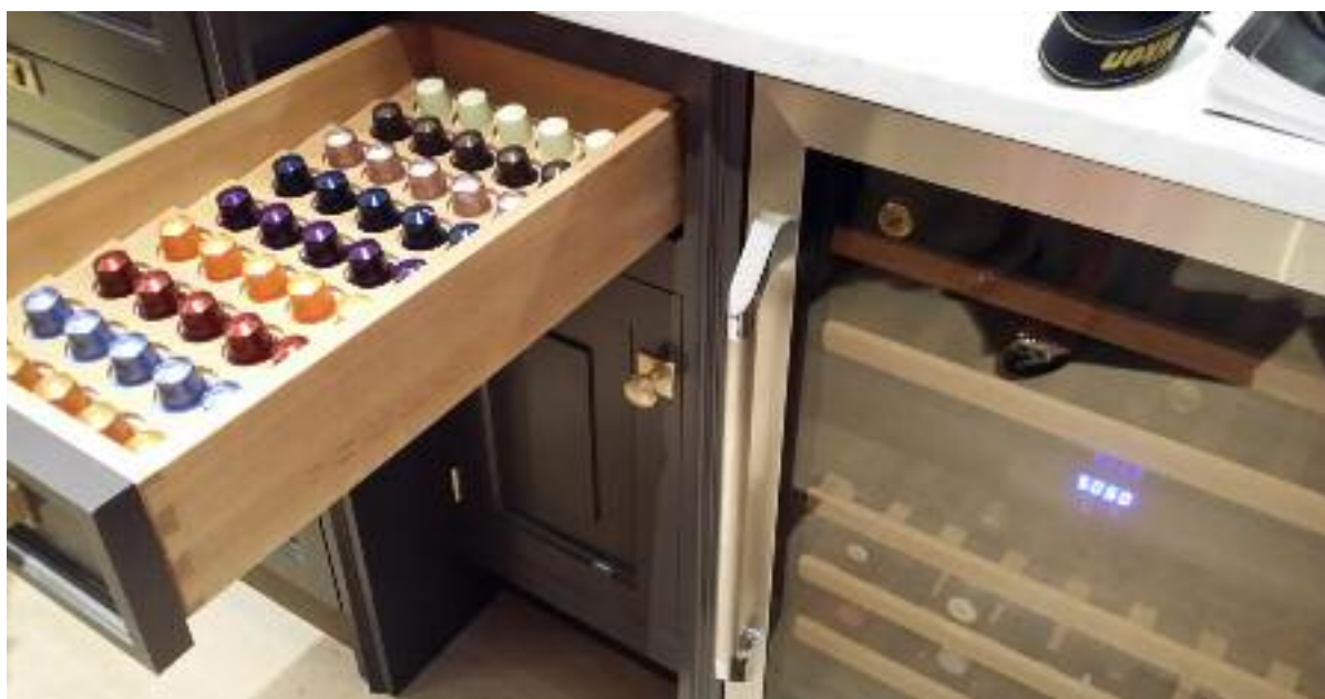
One detail in this kitchen was irresistible: a custom drawer for coffee pods. Over the top? Yes, but oh so fun for this orderly girl.