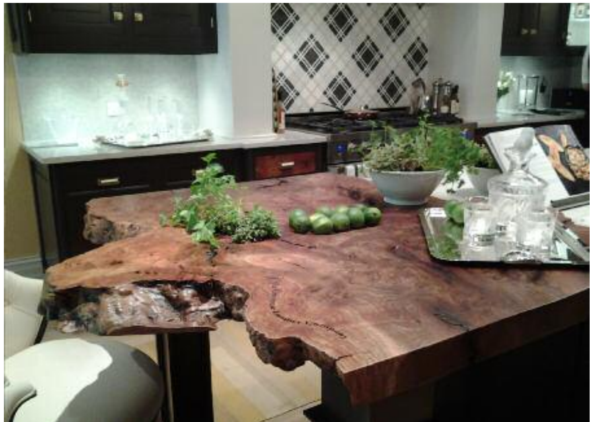
Each year for the past 43 years, Kip's Bay has put on a Designer Show House. This year's kitchen featured a live edge burl wood counter.