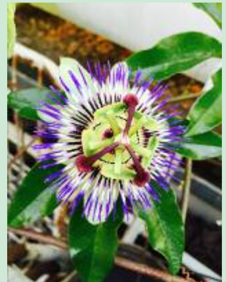
Add interest to your trellis with a perfect passion flower.

WIN a grant of $10,000 sponsored by the National Garden Bureau with a therapeutic garden that supports and promotes the health and healing powers between people and plants. For more information, visit www.ngb.org .