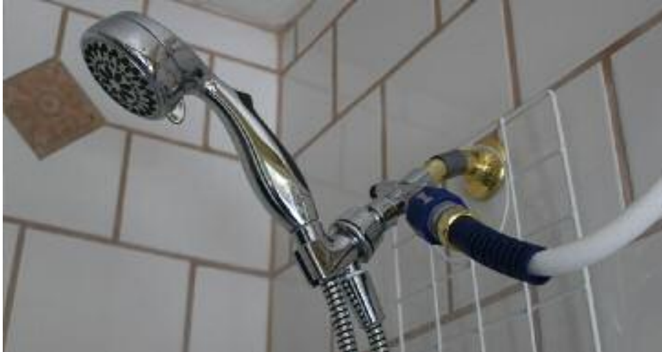
The blue ring shows the attachment of the reservoir hose. A turn of a valve diverts the water; the closing allows water to flow through the showerhead.

According to the California Department of Water Resources, the average household uses 360 gallons of fresh, treated water every day. Gov. Jerry Brown has called for a 20 percent reduction in that number, which has EBMUD and individual users thinking about how to make that cut. Agencies have recommended measures that are becoming more widely used, such as: