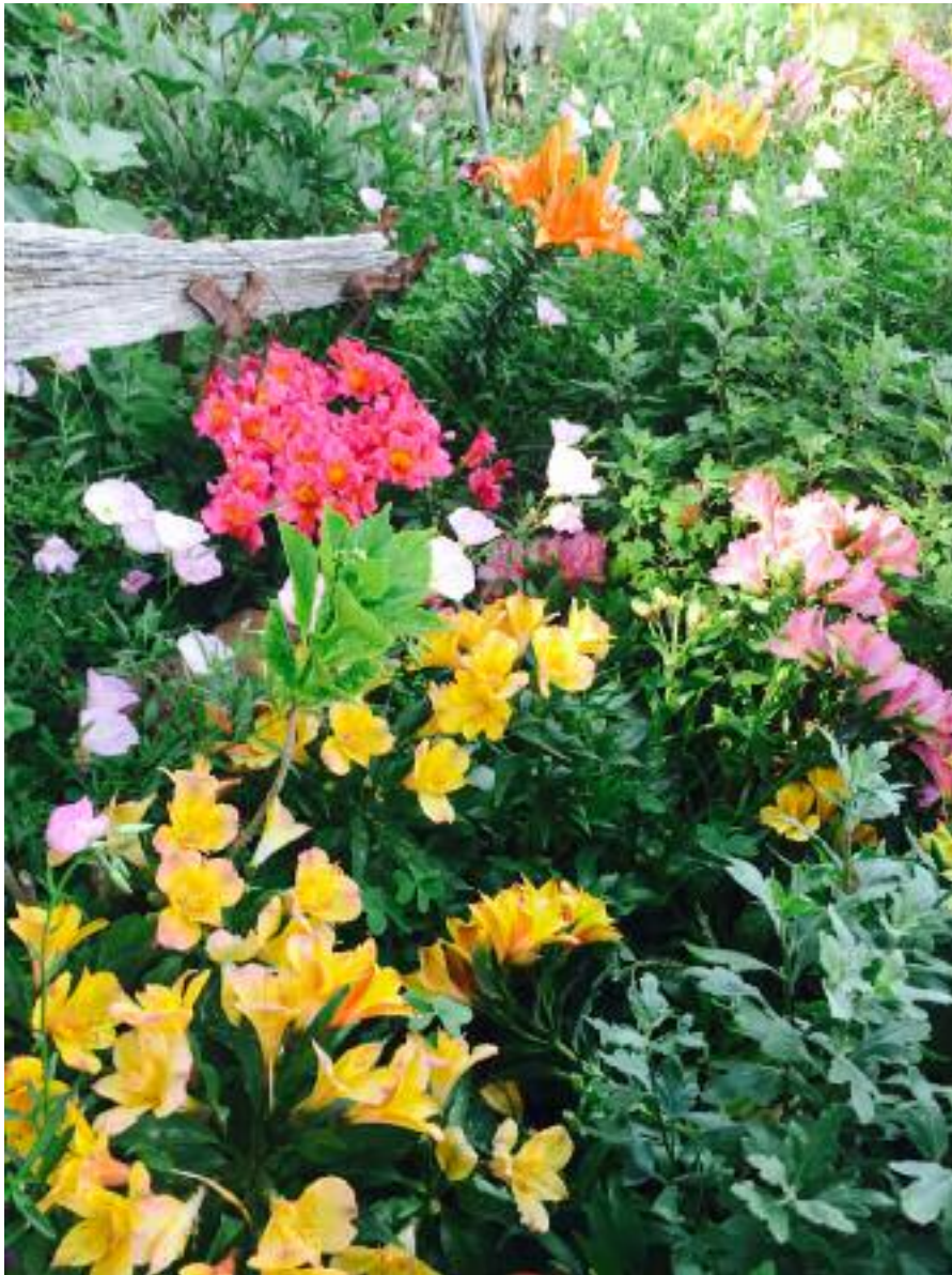
Alstroemeria and lilies are perennial beauties this time of year.

"Why stay on earth except to grow?" – Robert Browning