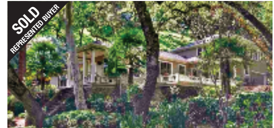
JON WOOD PROPERTIES