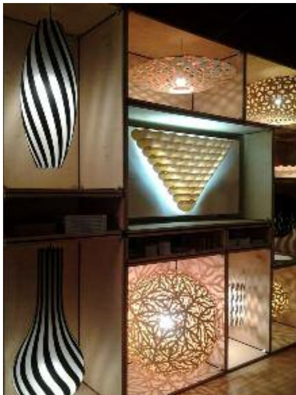
Lights from the Wanted Design show

These types of displays popped up in several shows. I felt the theme of real life penetrated through