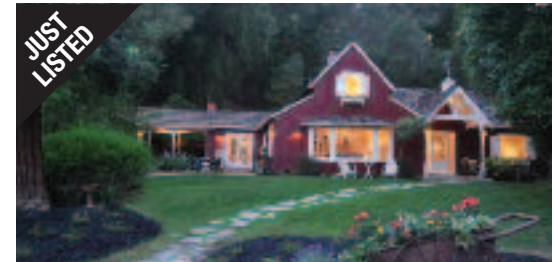
JON WOOD PROPERTIES