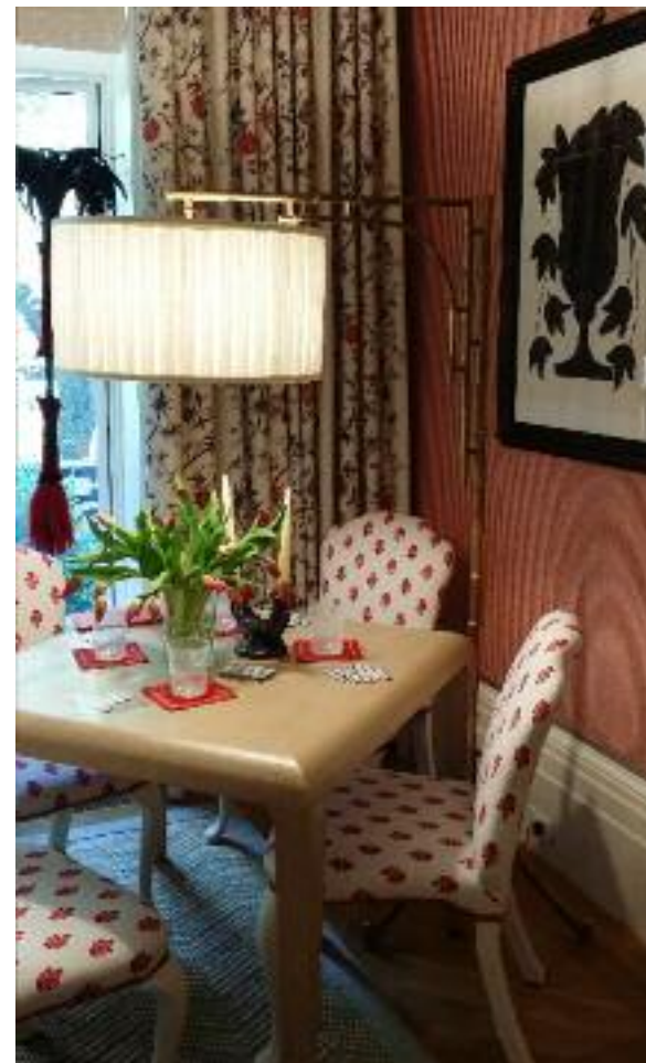
A few years ago a table may have been all straight corners and heavy lacquer. Today it's rounded with upholstered chairs. Still fresh, but easier on the eye.