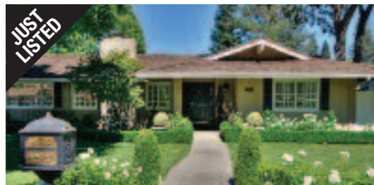
JON WOOD PROPERTIES