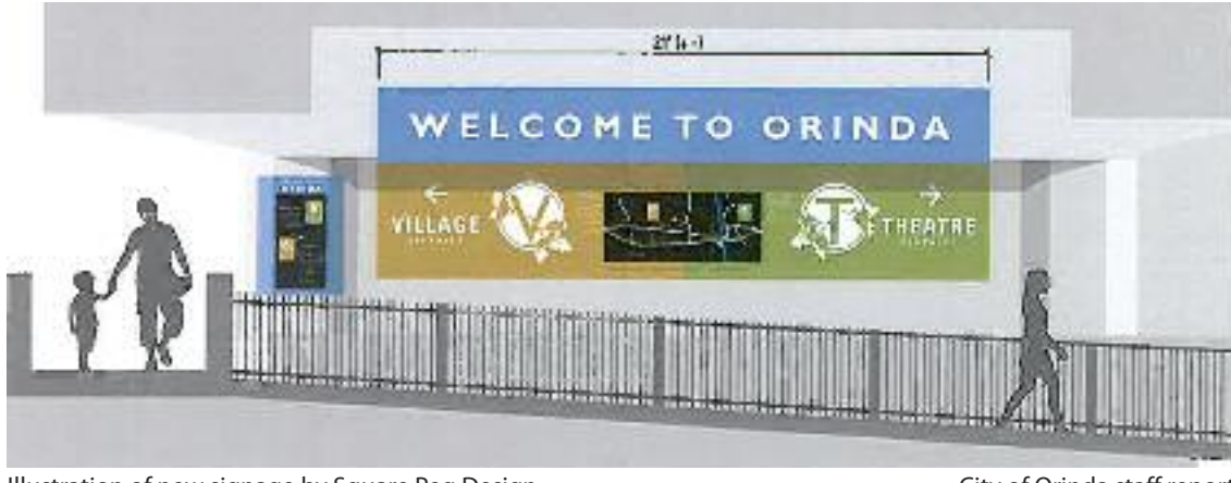
Illustration of new signage by Square Peg Design