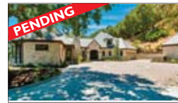
LAFAYETTE $6,500,000 5/5.3. Happy Valley new const., 2.91 acre w/pano views, Chef's kit w/Pewter island, pool and spa. The Beaubelle Group CalBRE#00678426

5 Moraga Way | Orinda | 925.253.4600 2 Theatre Square, Suite 211 | Orinda | 925.253.6300