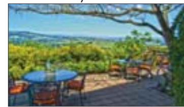
LAFAYETTE $2,400,000 4/2.5. Luxurious Adobe Retreat. STUNNING views. Private wine country style estate, minutes from school & freeway. Susan Schlicher CalBRE#01395579