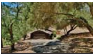
LAFAYETTE $1,349,000 3/2. LExceptional 1.22 acre lot to build or create your own unique estate. Let your imagination wander. Ana Zimmank CalBRE#00469962