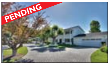
MORAGA $1,399,000 5/2.5. Classic traditional updated & expanded. Spacious rooms offering an abundance of light. Cathy Schultheis CalBRE#01005765