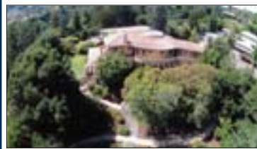
ORINDA $3,295,000 5/4.5. Breathtaking Mediterranean Estate with glorious Views, opulent paradise in the prestigious Glorietta vicinage. Vlatka Bathgate CalBRE# 01390784