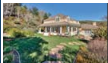
MORAGA $2,500,000 4/3.5. Exquisite estate in a very private setting! Gorgeous grounds w/large spa. 4542 sq. feet. Elena Hood CalBRE#01221247