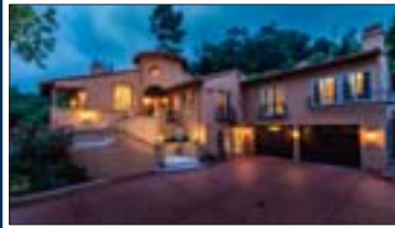
ORINDA $3,695,000 5/4.5. High Tech Lux. Tuscan Villa. 4757 sq. ft w/ 400 sf. Guest/Pool house on nearly gated acre in Sleepy Hollow. David Pierce CalBRE# 00964185