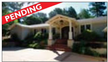
ORINDA $2,478,000 4/2.5. Fabulous Glorietta Home: over 1 acre & remodeled w/ incredible attention to detail. Finola Fellner CalBRE#01428834