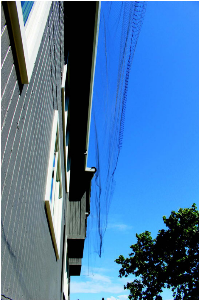
Some houses, such as this one in Orinda, sport bird nets to keep the woodpeckers away from the siding.

That has led to some homeowners setting up nets outside their houses to prevent the woodpeckers from landing in the first place. A new hole getting drilled right outside the bedroom window at 6 a.m. is not exactly a welcome sound. ... continued on page D4