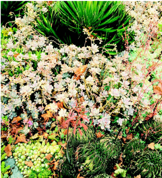
Succulents and cactus create artistic and imaginative drought-resistant landscapes.