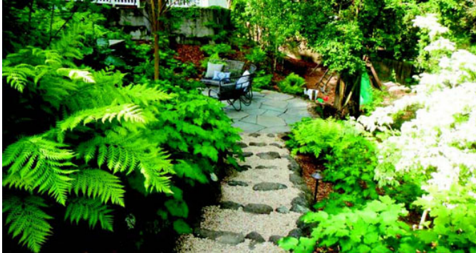
Small residential maintenance category winner Lazar Landscape Design & Construction