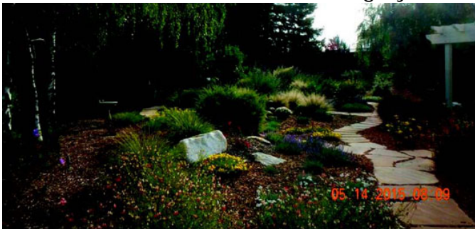
Sustainable landscape installation category winner Roxy Designs

Reach the reporter at: cathy.d@lamorindaweekly.com