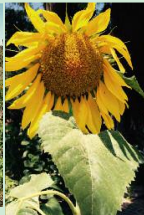
Sunflowers make us smile.