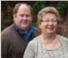
THE CHURCHILL TEAM