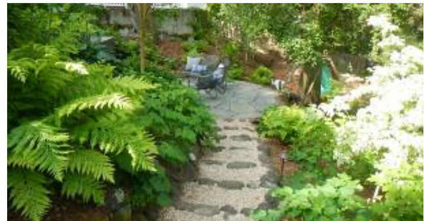
Small residential maintenance category winner Lazar Landscape Design & Construction