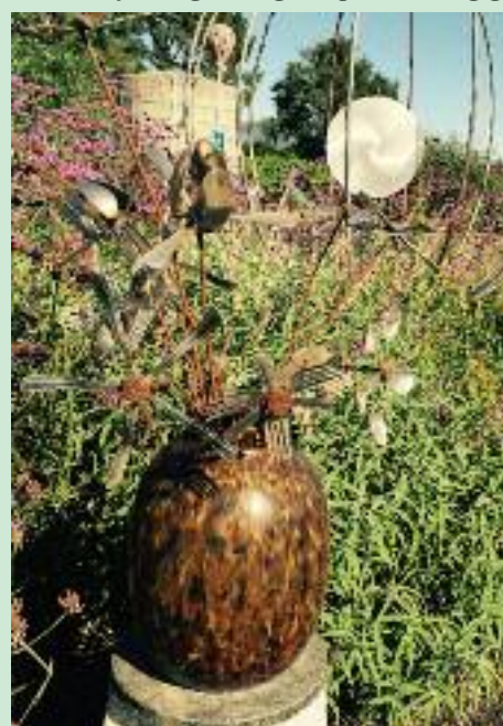
Get creative with your castoffs. Add art to the garden!