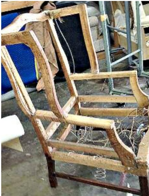
Wing Chairs are classics. I especially like this frame because it has a curved side flange and a curved front leading edge.

It's summer and that means people all over are cleaning out, dusting off and remodeling. Even businesses take time during the slower summer months to clear out storage areas, and tidy up. How do I know? We get called for design solutions during the summer months. It finally dawned on me: People