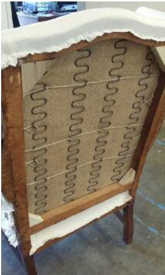
The back will be finished off in our custom lining, making the muslin covered chair ready for a custom slipcover.

If I had contracted my frame maker to create this same model from scratch, the wood construction alone, not including springs and eight-way hand ties, would have been $650-$700, wholesale. It has a curved front edge and curved wing flanges – not inexpensive details, yet they were ‘hidden’ under ugly.