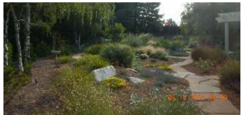
Sustainable landscape installation category winner Roxy Designs