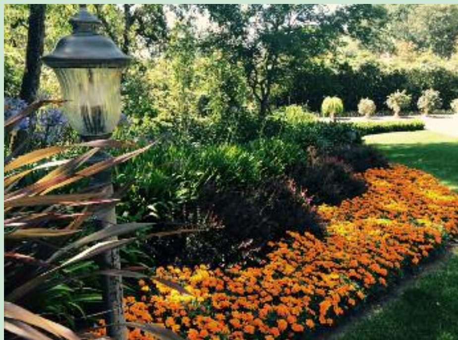
A swath of marigolds lights up a soothing garden area.