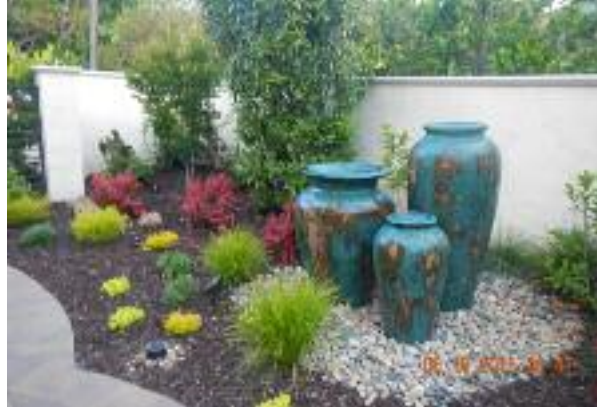
Medium residential installation winner by Garden Lights Landscape and Pool Development