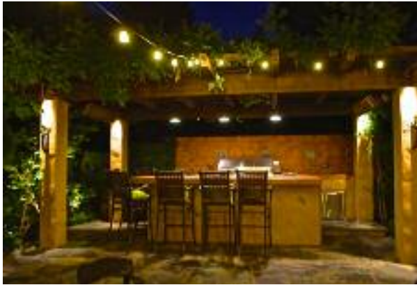
Special Effects Lighting winner by Garden Lights Landscape and Pool Development