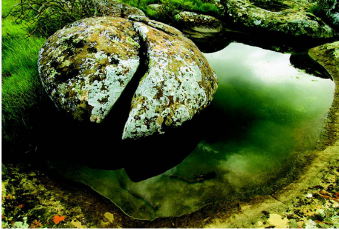
"Black Meadow Pool"

one of those special places I was very fortunate to photograph. We really don't have any other spot like that."