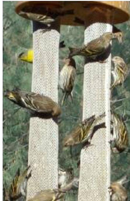
Finches feeding at a garden feeder

Here are ways to maintain flocks flying as your personal aerial garden rescue crew.