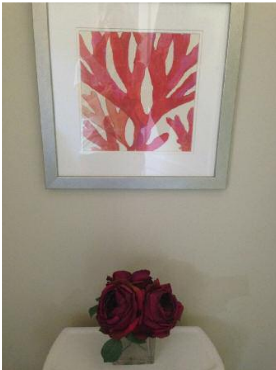
Artwork and accessories are a great way to express the Fire element of summer like in this Orinda bathroom.

Good kitchen feng shui is especially important to fuel all of our passionate adventures of exploring in life. Good feng shui for the kitchen begins with clean and tidy counters, floors, the refrigerator and especially the stove to prepare your foodie masterpieces.