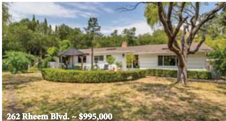
262 Rheem Blvd. ~ $995,000