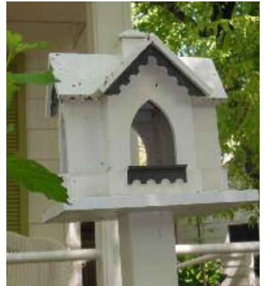
A favorite birdhouse

The appeal of birds in our backyards is immeasurable. While watching their antics and enjoying their beautiful plumage as well as their melodious song is intriguing, the grand dividend for gardeners is their free assistance as garden helpers. Birds are constantly turning over leaves, scratching in mulch, or flitting from bush to tree finding their meal of insects we never see. Birds such as flycatchers and swallows decimate flying pests. Seed-eating birds will glean 95 percent of the weed seed that grows every season. When we welcome birds to our backyards, we are creating a home landscape that will naturally ward off diseases and pests. Bacteria and spores struggle to survive as our gardens become more organic creating a natural balance between pests and plants. ... continued on page D14