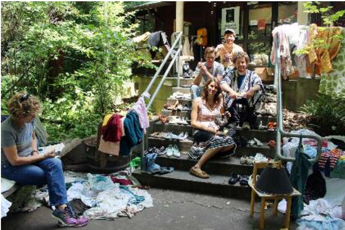
Items are displayed at this recent "Free Swap" in Canyon.