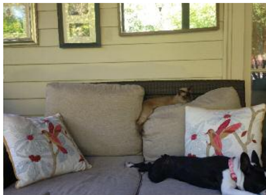
This Lafayette home uses red summery hues to activate the Fire element.