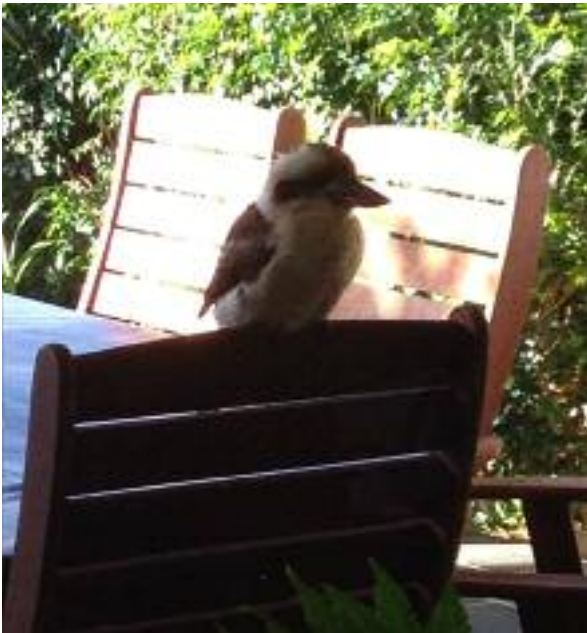
A Lamorinda reader from Australia wanted to share her garden friend, the beautiful, friendly kookaburra with our readers.

"I value my garden more for being full of blackbirds than of cherries, and very frankly give them fruit for their songs." — Joseph Addison, essayist and poet (1672-1719)