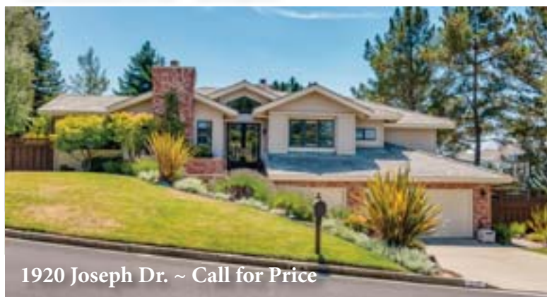
1920 Joseph Dr. ~ Call for Price