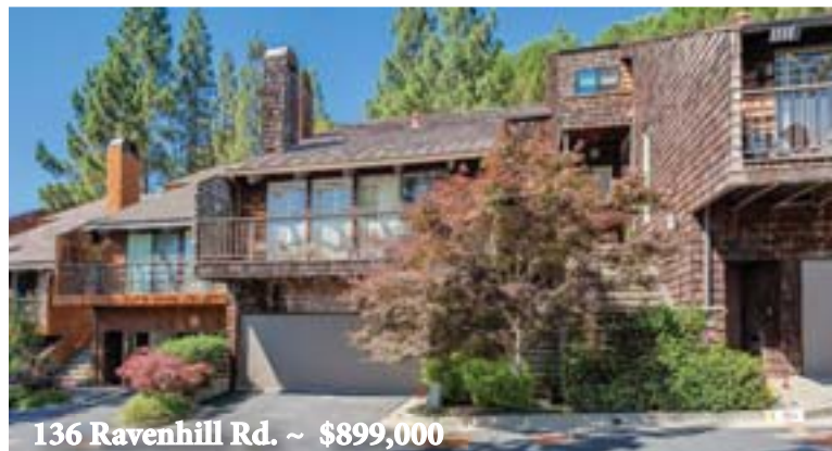
136 Ravenhill Rd. ~ $899,000