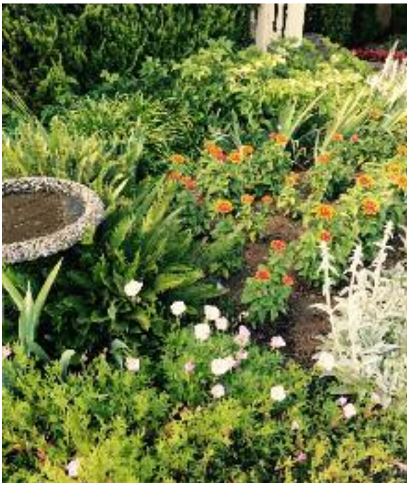
Make sure to have a birdbath. Plant zinnias and other plants that birds will enjoy.

Are you attracting birds to your backyard? In the past few months, I have received numerous emails and calls from readers literally around the world asking questions about our flying friends. Many people have indicated that the bird population has increased in their landscaping, with some gardeners enjoying first-time visitors.