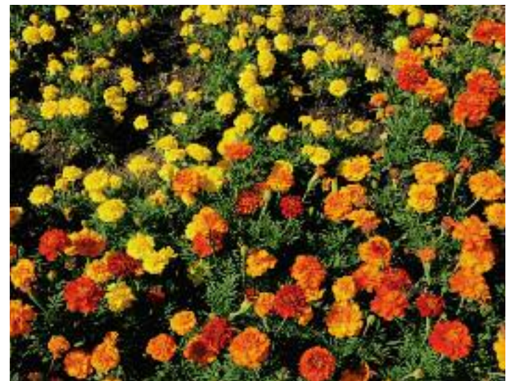
Marigolds are a favorite summer plant.

Take care of your birds and they will take care of your garden. Life is for the birds!