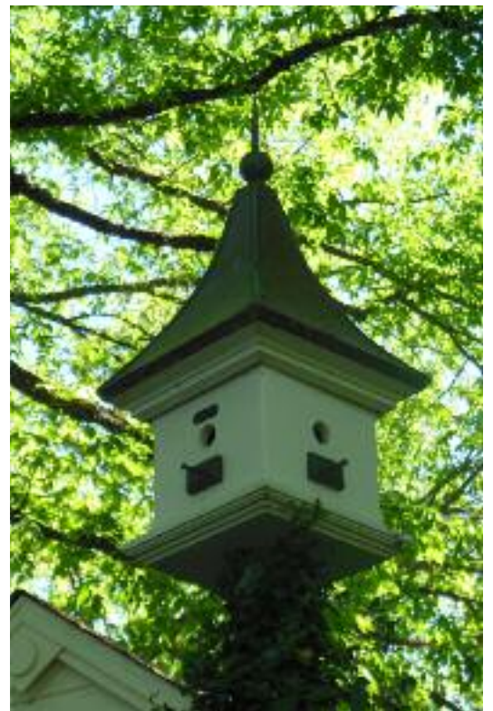
This is a cozy and safe nesting place for our feathered friends.