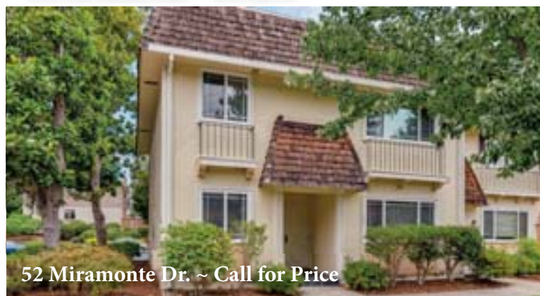
52 Miramonte Dr. ~ Call for Price