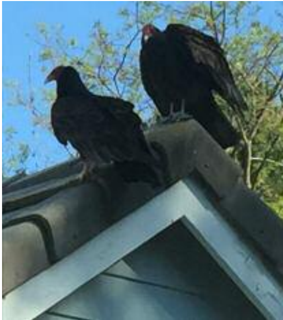
I thought I was in a remake of the classic film, "The Birds" when vultures and crows swarmed my rooftop.