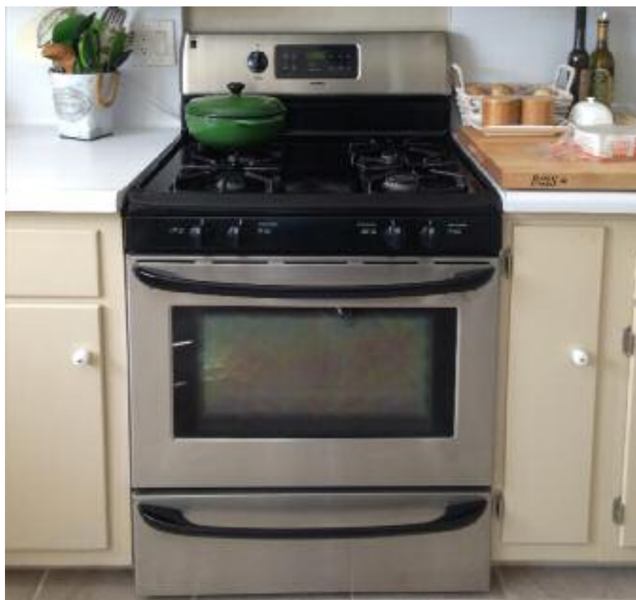
Proper stove feng shui includes keeping the appliance spotless. A white kitchen shows off food vibrancy the best, as at this Moraga home.

Whether you are cooking up some grilled vegetables, salmon, sautéing a mushroom base sauce or stewing summer fruit for a pie, remember auspicious kitchen