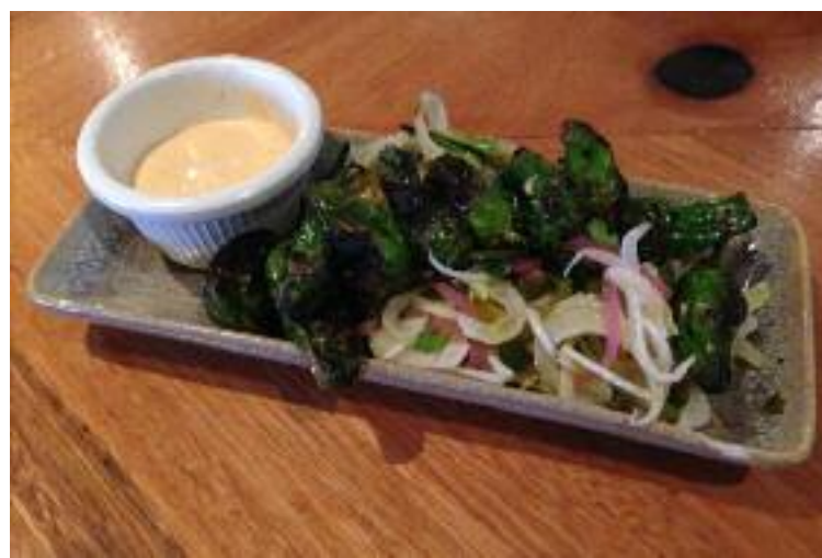
Grilled pardon peppers