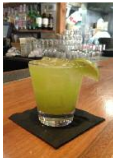
Smokey margarita

When: 3-5 pm, Monday-Friday Where: 3616 Mt. Diablo Blvd., Lafayette Drinks: $4 Modelo, $7 House Margarita, $10 Prima Margarita Food: $3-8 Antojitos (small plates) Recommended: Smokey Mezcal Margarita and Grilled Padron Peppers