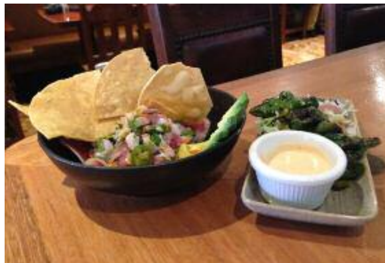
Rockfish ceviche and grilled pardon peppers