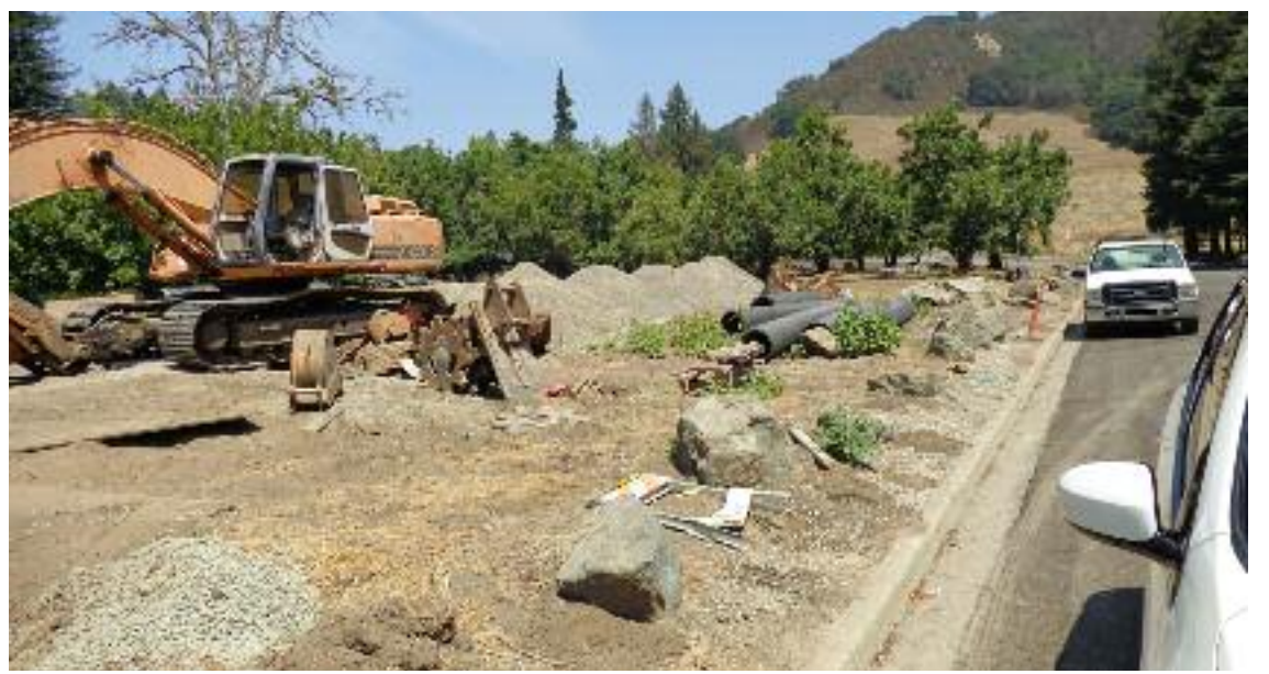
Heavy equipment and pipes that are part of storm drain upgrades on newly formed subdivision on Franklin Lane.

Contrary to some rumors that may be swirling about, the heavy equipment on Franklin Lane in Happy Valley is for work on a drainage project that was a condi-