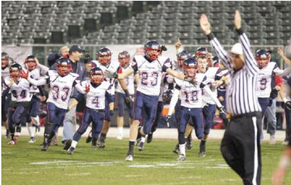
2011 Campolindo team celebrates NCS Championship