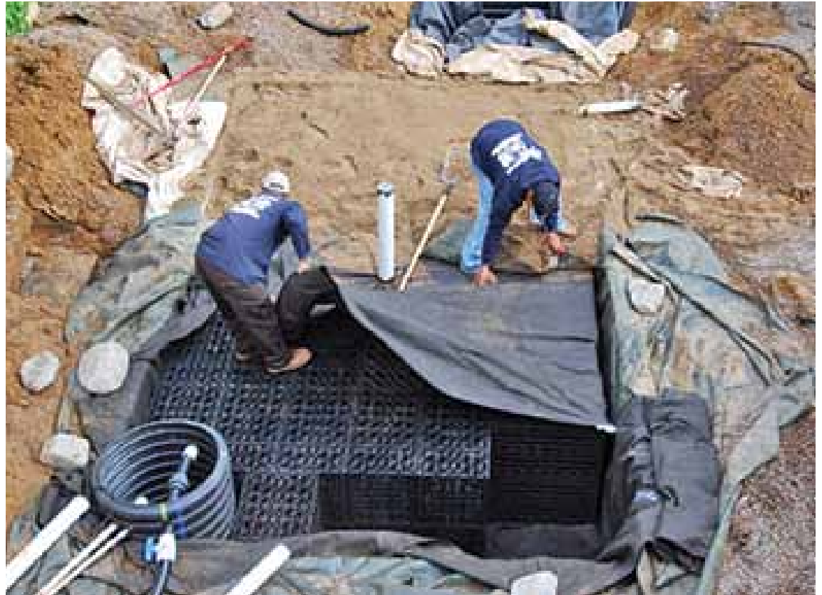
Swimming pool to rain tank conversion