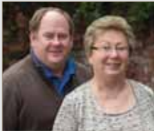
THE CHURCHILL TEAM