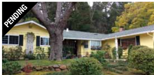
JON WOOD & HOLLY SIBLEY