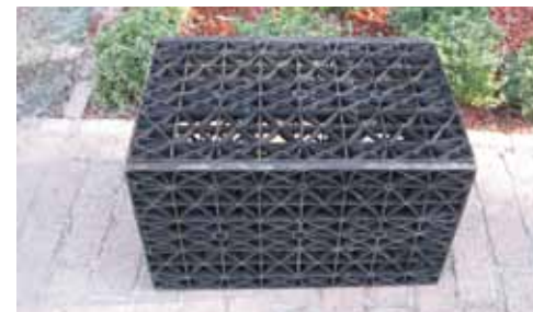
Fully assembled Eco Rain Cube

Wolosenko said cistern installation costs are dependent upon size, but average $2 to $3 per gallon of water stored. Wolosenko has personal experience with pool upkeep, having lived in several houses with backyard pools. "I hated those pools," she said, emphasizing the expensive monthly upkeep she incurred with each one.