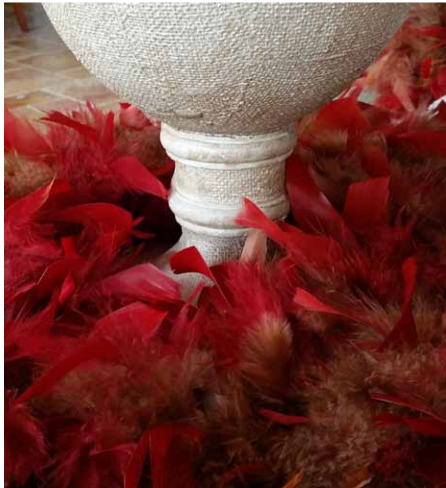
Be sure to look for ways to add texture with your color palate, like with these deep red feathers.