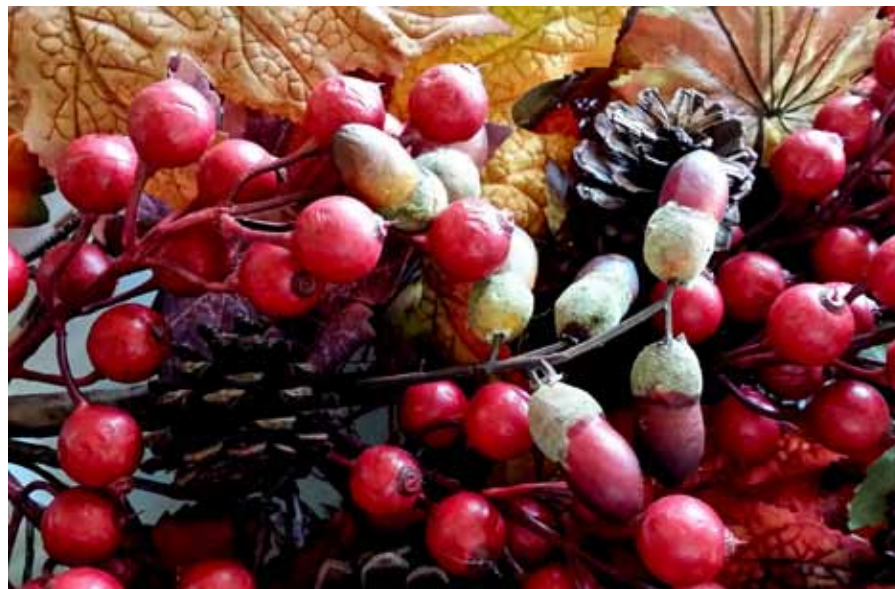
These berries and maple leaves complement any holiday décor.