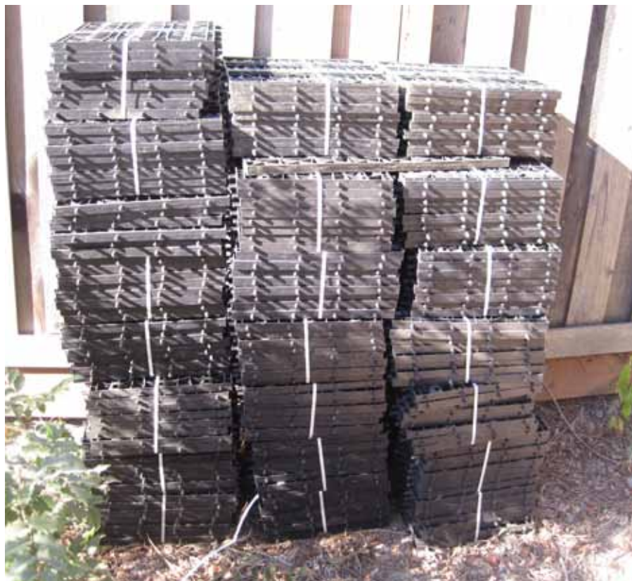
A stack of Eco Rain Cubes prior to assembly