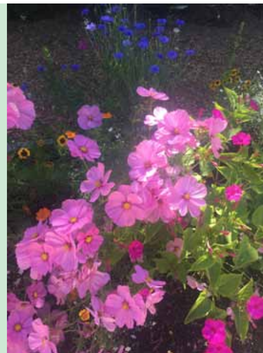
For bursts of color and easy care, save seeds of cosmos, bachelor button, and four-o'clocks for sowing next spring.