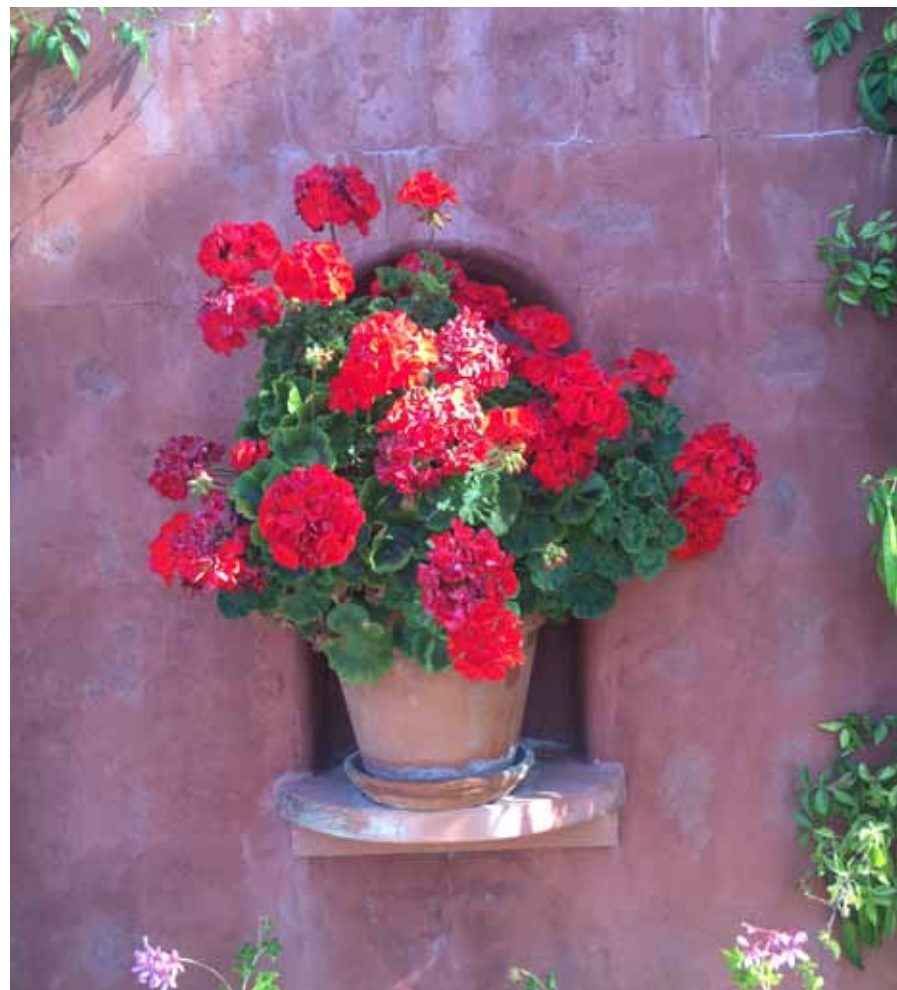
Create a beautiful nook with a pot of bright red geraniums.