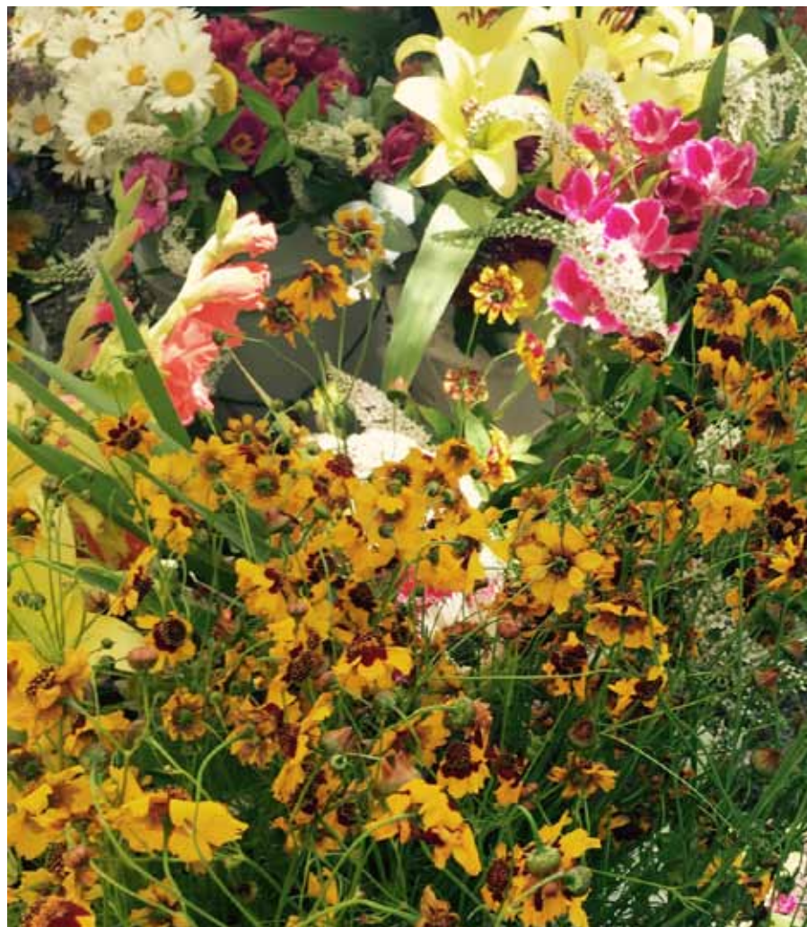
Lilies, Rudbeckia (Black-Eyed Susan) and Gladioli are low-maintenance, multi-blooming and drought tolerant.

"Go forth under the open sky, and listen to Nature's teachings." ~ William Cullen Bryant