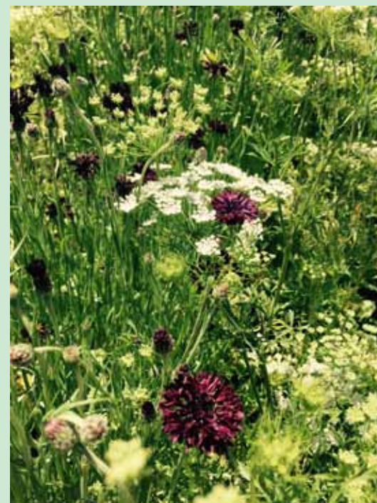
More seeds to gather for spring planting: Queen Anne's lace and purple bachelor buttons.