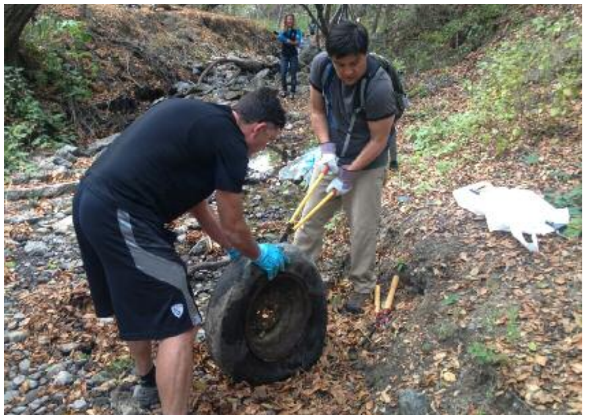
Creek Day volunteers