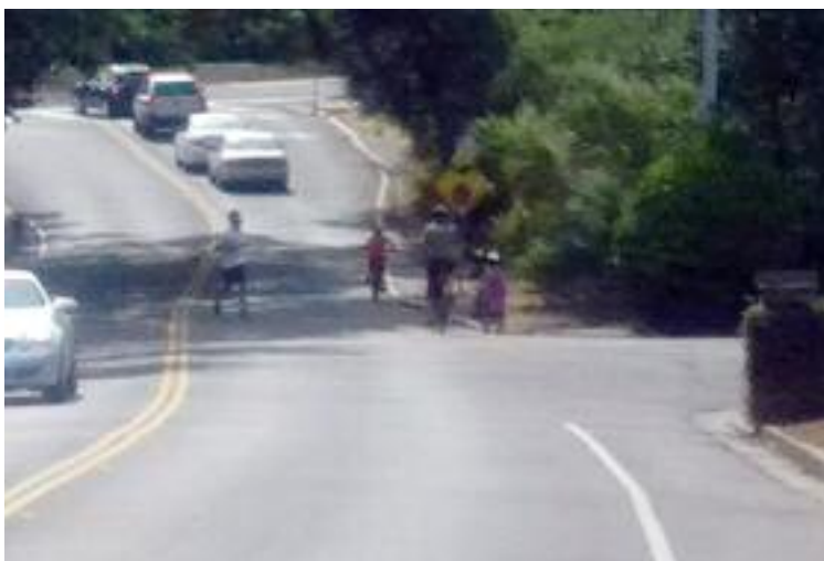
A runner crosses Rheem Boulevard to reach the sidewalk while a mother keeps her children as close as possible to the side of the road. Missing bike lanes and sidewalks force pedestrians, bikers and drivers to share the road.

Dave Campbell is a pro when it comes to bikeability. The advocacy director and the Bike East Bay team have been working for 33 years to make Contra Costa and Alameda counties more bikeable. They have conducted studies in Piedmont, Pleasant Hill, Fremont and last month Berkeley. Now it is Moraga's turn, as part of the bike and pedestrian plan conducted by the town. Riders of all ages and abilities are invited to partake in a two-hour bike tour of the town with planning staff and Bike East Bay specialists Oct. 3 to explore what it would take to make Moraga