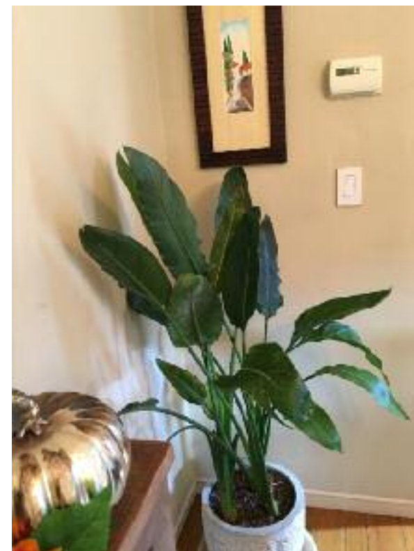
Minimize the wood element in this middle right area to protect plants.