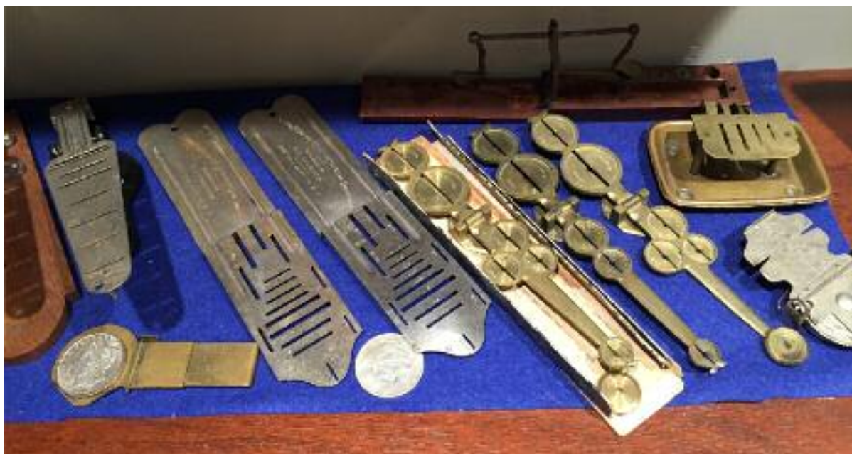
A collection of counterfeit coin detectors from Doug Scougale's collection. The slots verified proper coin size, the scale showed whether the metal was truly precious metal or a counterfeit filled with lead.