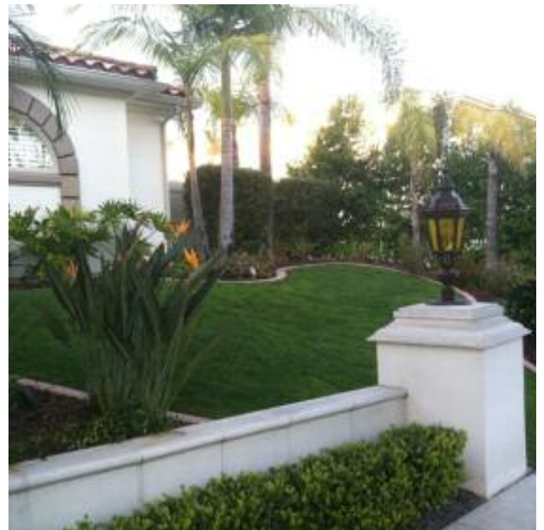
Pearl's Premium lawn after three months of planting