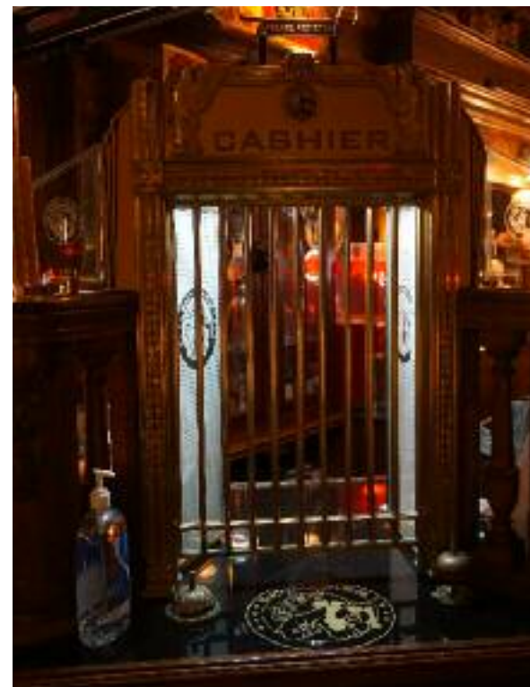
Engel's trophy business has allowed him to do some of the glass etching on display at their casino garage.