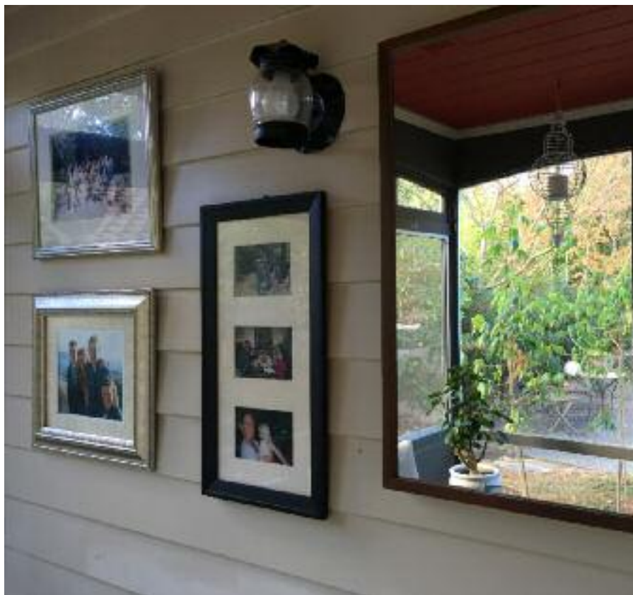
Children's photos correctly placed hang prominently in the middle right area of this Moraga home.

Save your plants for better energetic areas of your home or office. If there is a fireplace in this metal area, we can adjust this anxiety-producing mix by applying the water element, which controls fire. Mirrors represent the water element, so placing a mirror over a fireplace in this location adjusts this friction nicely.