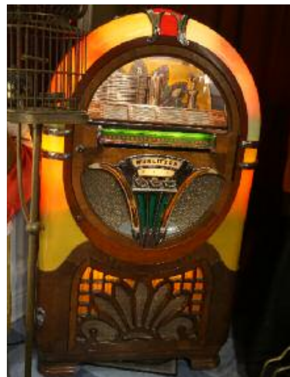
The Wurlitzer jukebox plays 78 LP records. It is stacked with music from Frankie Avalon, Ritchie Valens, the Everly Brothers and Jerry Lee Lewis