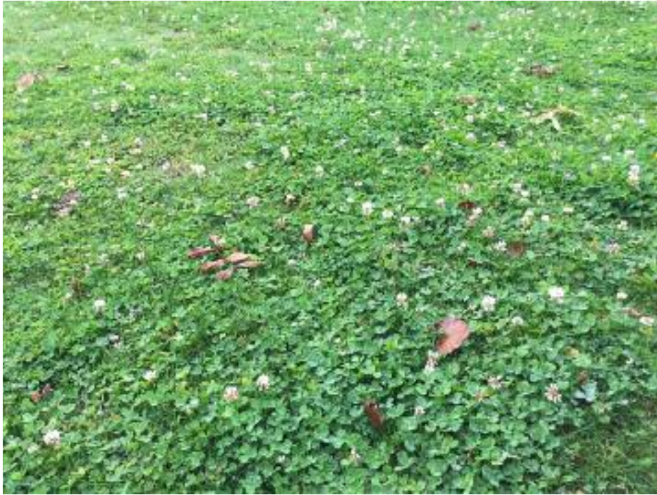
Large white clover mixed with grass for a lawn