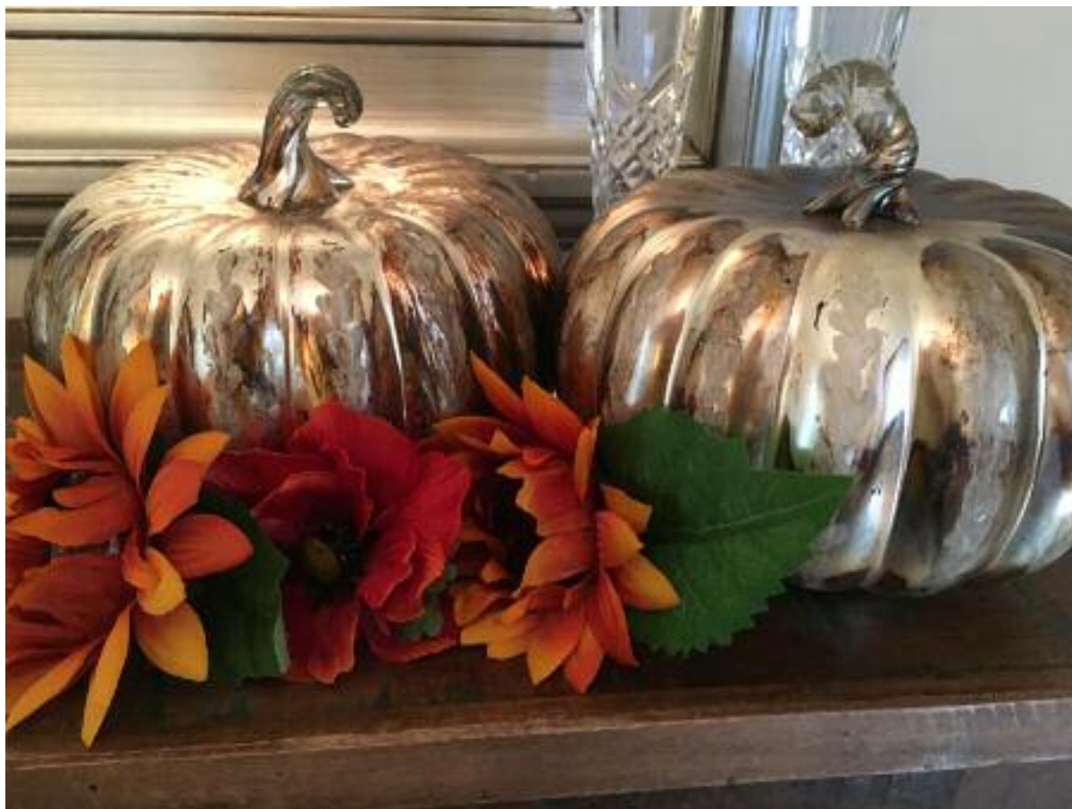
Silver pumpkins and orange or "earth" silk flowers activate metal in this Lafayette home. Photos provided

Walking around Lamorinda I am always delighted by the clever fall displays of pumpkins, gourds, and fall wreaths. There is a truly clever witch display in Orinda, with said witch, driving her broom straight into a tree. Sweet. With days getting shorter and with the challenges shorter days present, such as living with less natural light, celebrating with all of our children and family around balances out the fall and winter seasons perfectly.