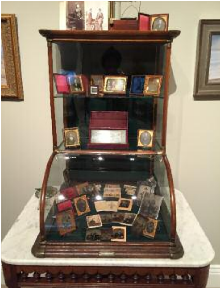
The case containing Scougale's Gold Rush-era daguerreotypes was custom built by a friend.