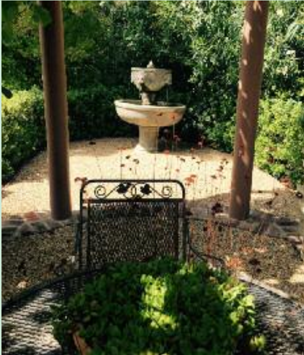
A former lawn replaced by a gravel Zen garden