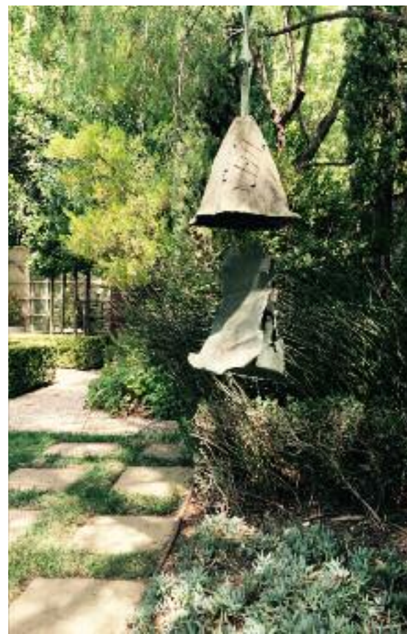
A stone path with grass inserts in a drought garden