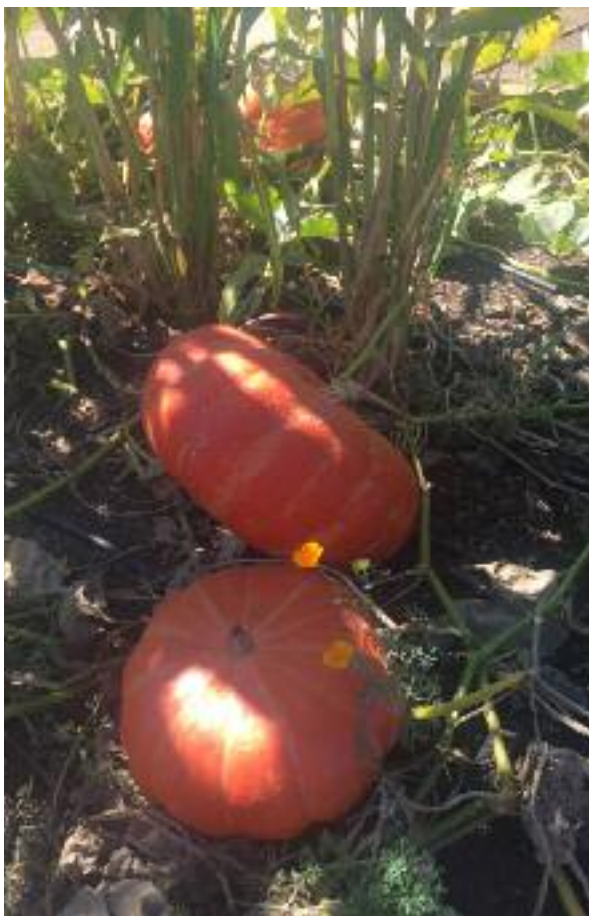
It's November and pumpkins are ripe and ready.

"We need to teach people that the environment has a direct bearing on our own benefit." – Dalai Lama