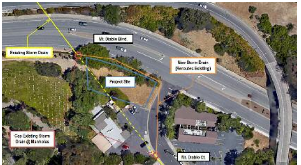
Image provided by EBMUD depicting location of existing and future storm drains.