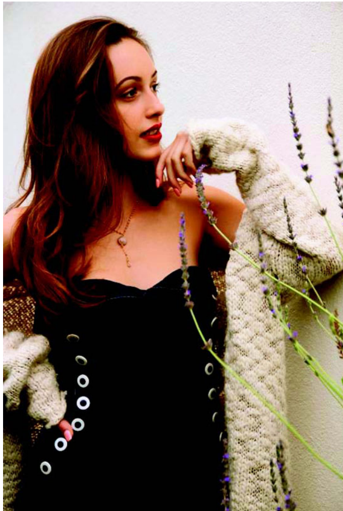
Urban Rocks jewelry trunk show at J. Colleen Boutique