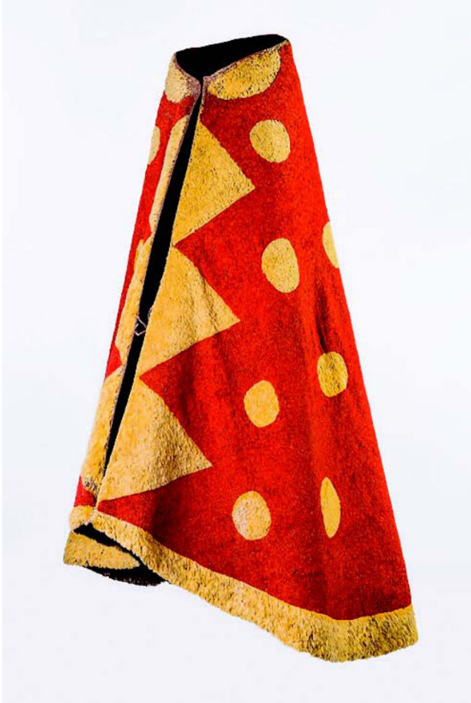
Feather cloak exhibited at the de Young Museum.