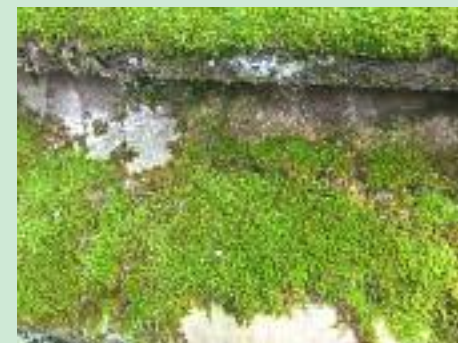
Moss is pretty growing on a winter wall.