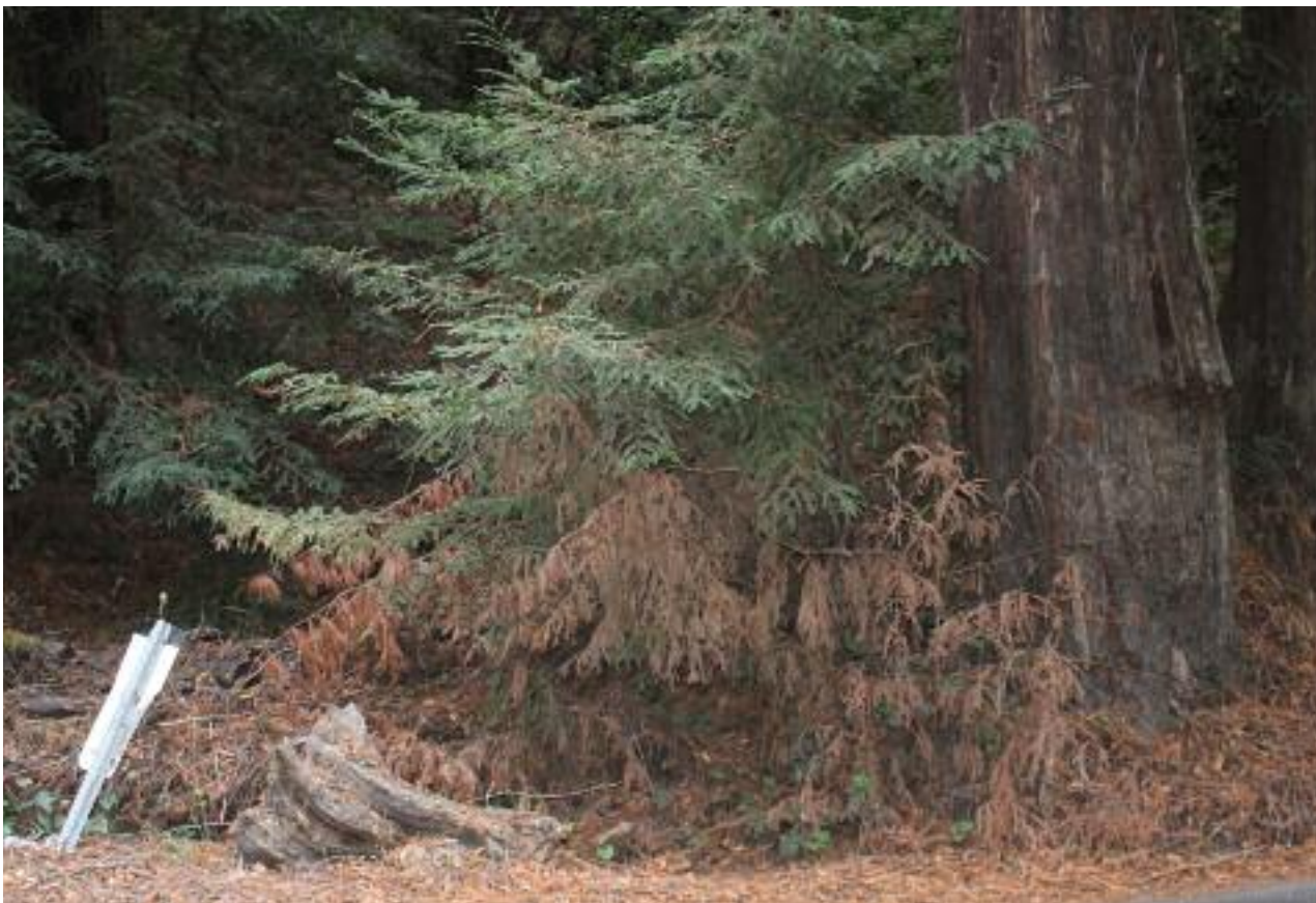
Redwoods are especially suffering in the Lamorinda area with the drought. The upper branches and lower ones, like these, die off to conserve water, according to experts.