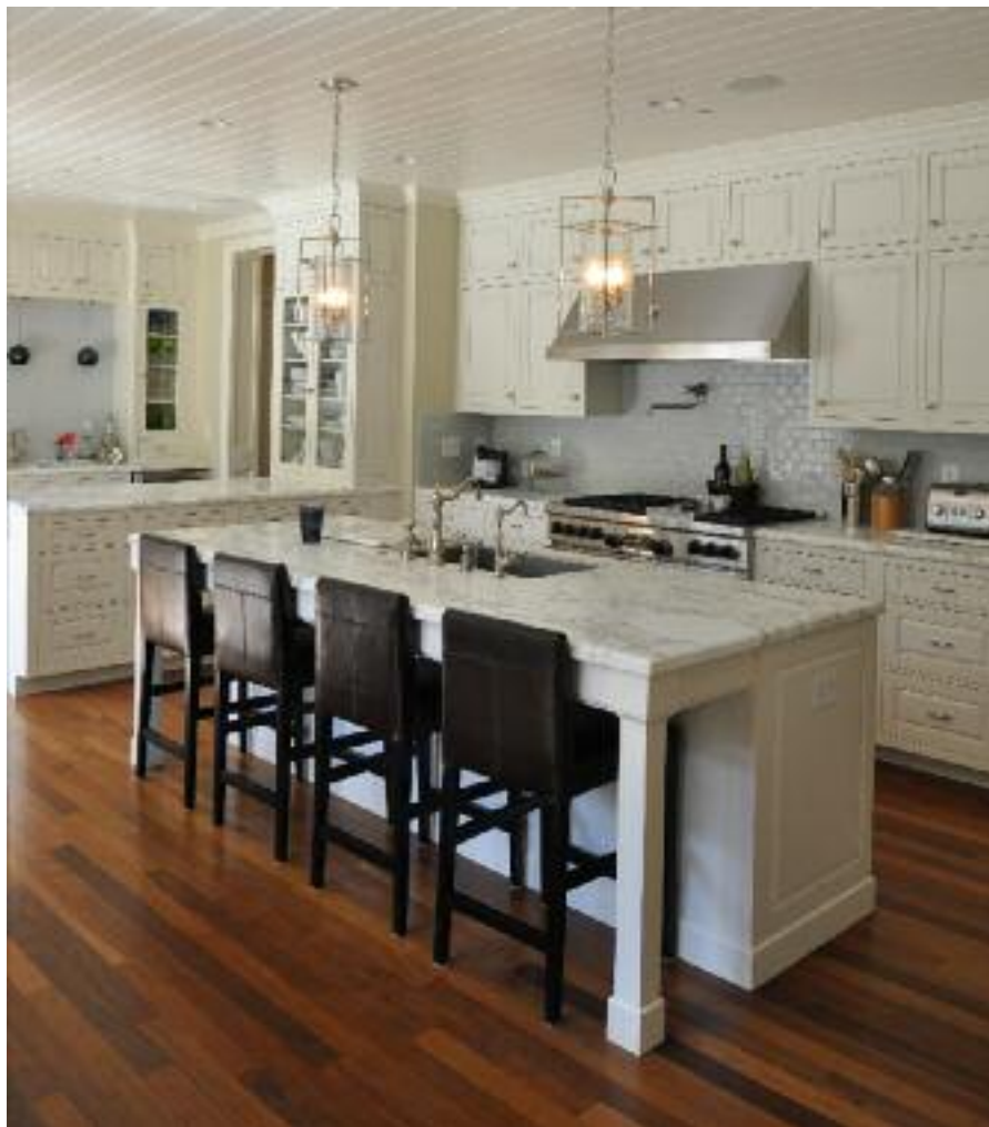
A white kitchen shows off food the best

How do you create holiday glow in your home? For many, it starts with a personal commitment to glow from within. Even in winter, our hearts and minds should be like bamboo: flexible and pliant, not rigid and frozen. Bring fiery, passionate warmth inside with loving gestures that affirm your commitment to self so you can manifest joy for others fully and completely.