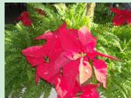
A combination of ferns and poinsettias brighten a porch.