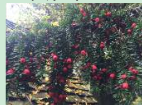
Yew berries are excellent for holiday decorating.