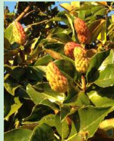
Magnolia cones turn red in December.