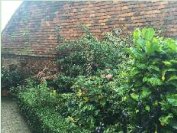
Although it is the end of the season, boxwoods, hydrangeas, rosemary and greenery brighten this corner.

As we prepare for the holidays, let's offer thoughts and actions of faith, hope, and love with the expectation that peace can prevail on our beautiful planet. Take pleasure in nature. Our gardens are a precious refuge. Happy Holidays!