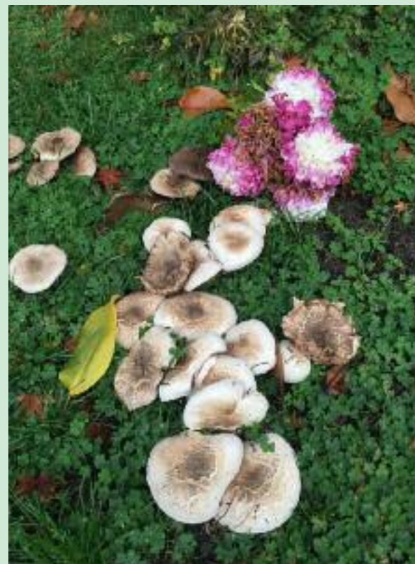
As tempting as it is to collect mushrooms, unless you are an expert, refrain.