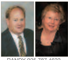
THE CHURCHILL TEAM