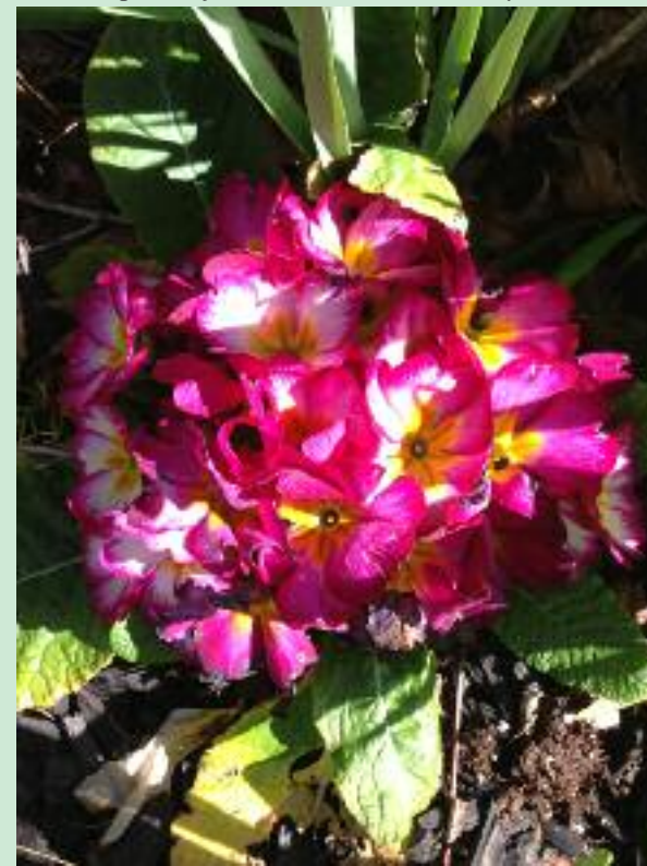
Plant pretty primroses for instant color all winter long.