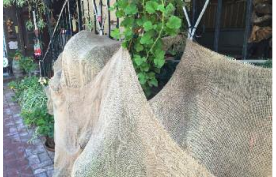
Drape burlap over tender plants to prevent frostbite.

"With our thoughts, we make the world." ~ Buddha