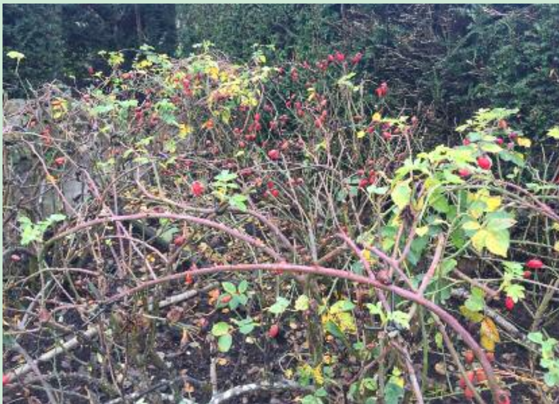
Rose hips can be twined into décor or made into teas for the holidays.