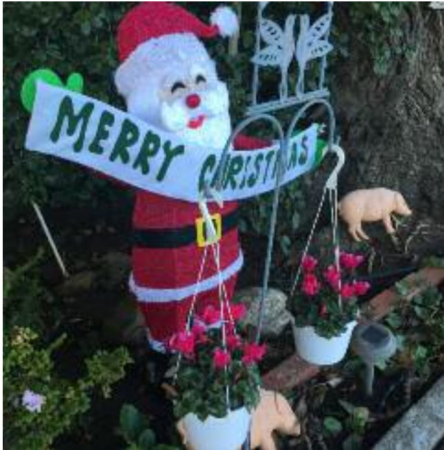
A combination of ferns and poinsettias brighten a porch.