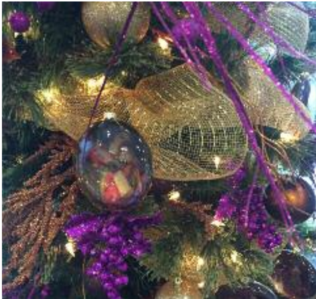
Surprise your guests with passionate purple ornaments.