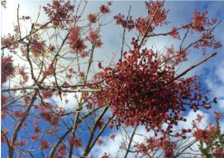
Pistachio berries are food for the birds and décor for your table.