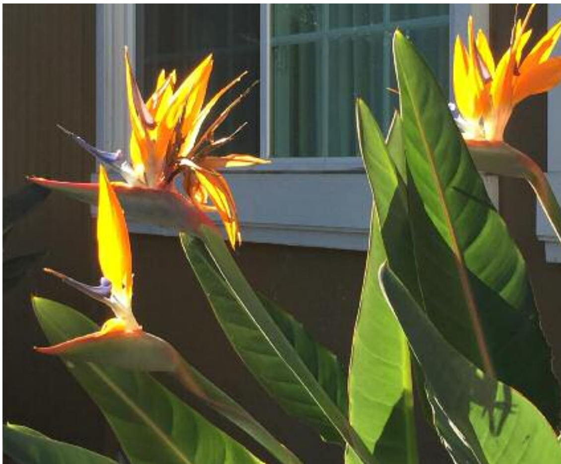
Birds of Paradise bloom in January, even in the cold.

"All I have seen teaches me to trust the creator for all I have not seen." ~ Ralph Waldo Emerson