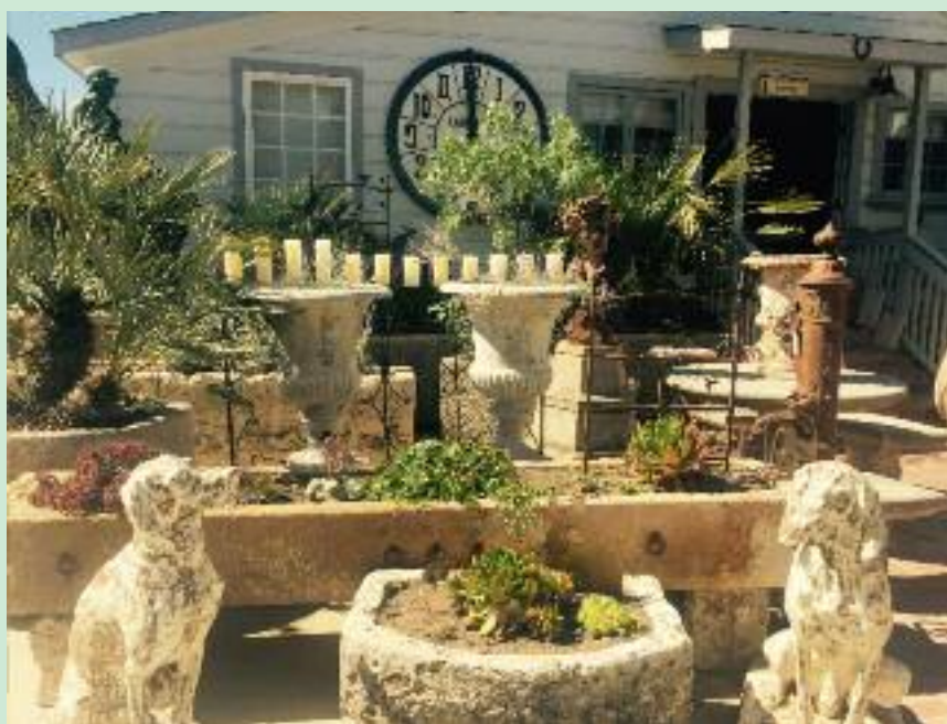
Statuary adds artistic bling to your landscape.