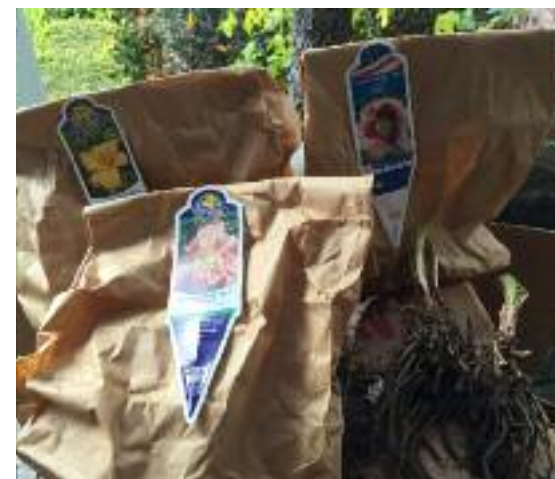
All American Daylilies are ready to be planted.