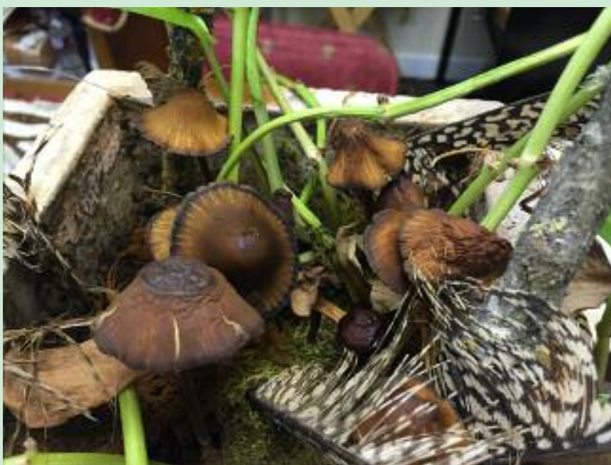
Toadstools sprout in a potted plant during the darkest night hours.

May peace be with you as you make the best of this season. Welcome to a bright new shiny year, each day anew!