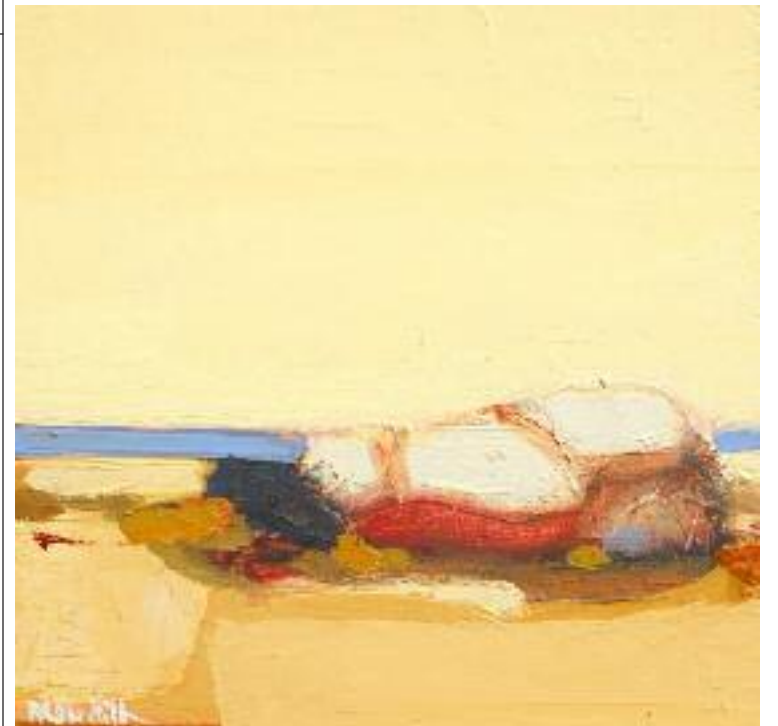
"Woman on the Beach" by Geoffrey Merideth