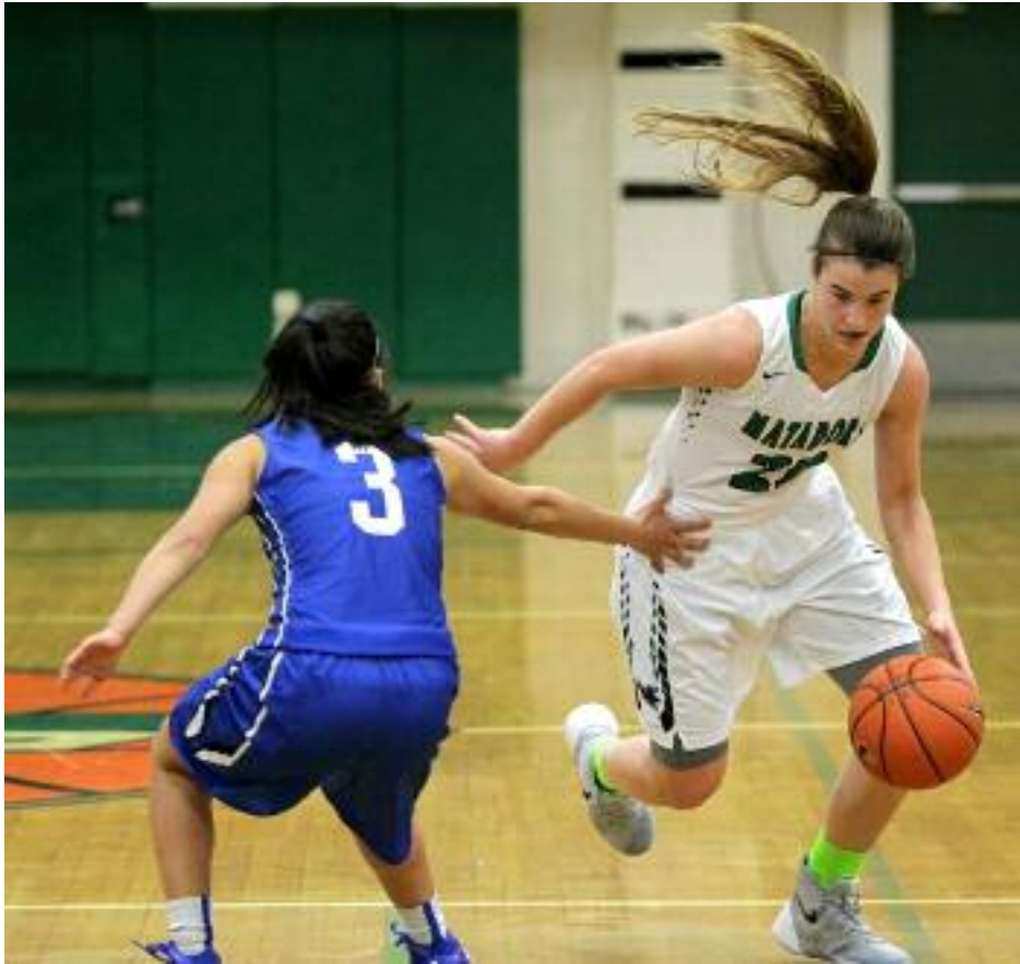
Sabrina Ionescu (20) scored 39 points with 10 steals and 8 assists against the Dons.