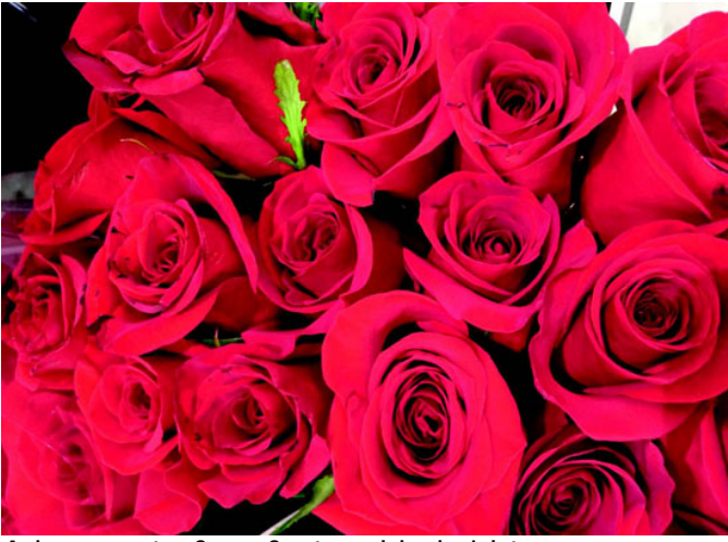
A bouquet of perfect red hybrid teas.