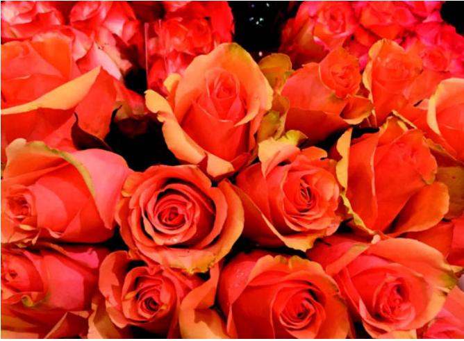
Salmon and orange-hued roses are welcome gifts any time of year.