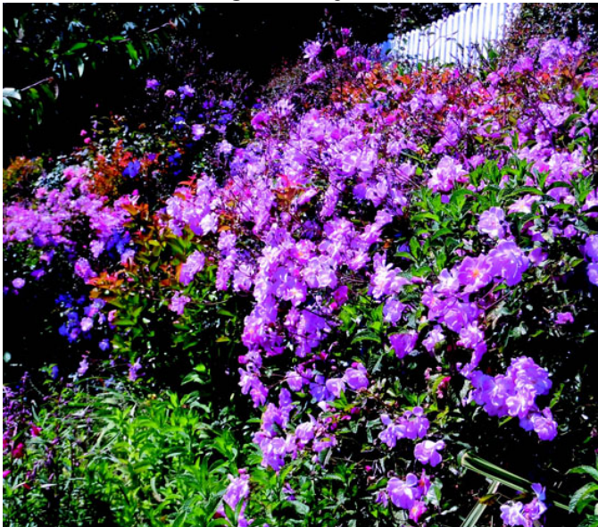
Shrub roses, also called carpet roses, blanket this hillside with frilly blooms.