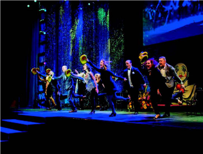
Town Hall Theatre cast of "Company" performs at the Jan. 16 Shellie Awards in Walnut Creek.

both Part I and Part II, which cost $25 to $32, can be purchased online at www.townhalltheatre.com or by calling the box office at (925) 283-1557.