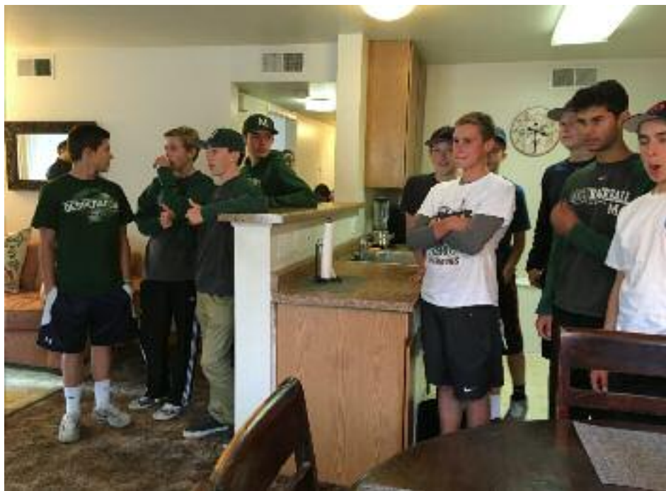
Miramonte baseball players spent a Saturday helping a family in need.