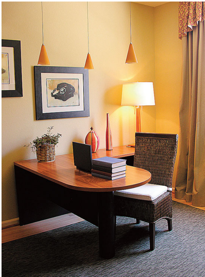
The desk in this home office shows the proper "commanding position."

I hope these tips will allow you to take immediate action to improve the Feng Shui in your environments for the start of a happy, healthy and safe new year.