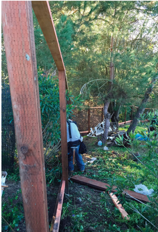
A crew builds a fence.

"Good fences make good neighbors." - Robert Frost