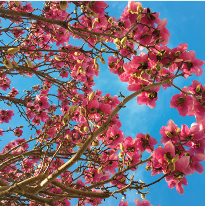
A magnificent tulip magnolia burst into bloom.