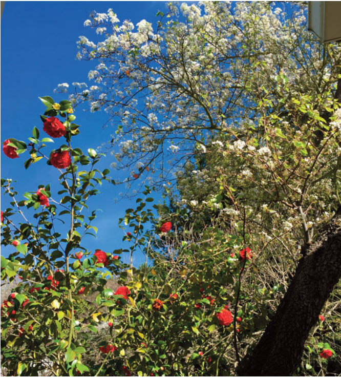
A pear tree in bloom flanked by a blooming camellia.