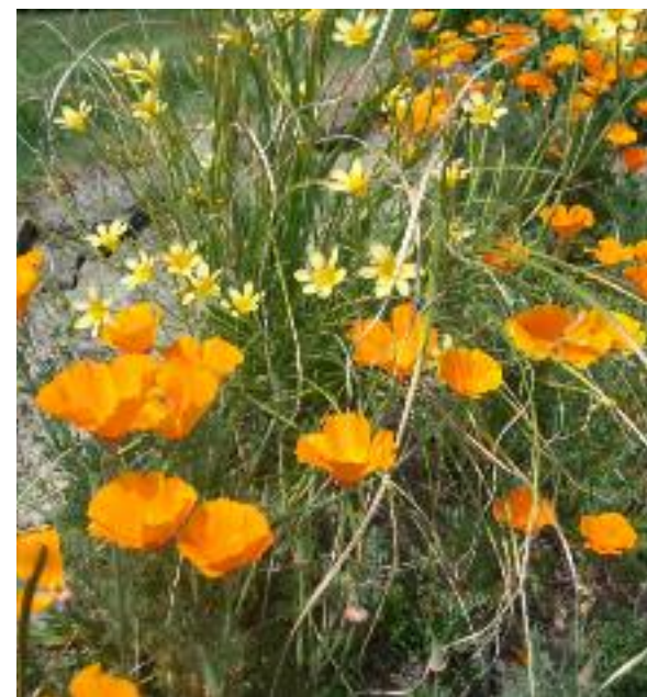
California poppies and wild iris makes a stellar combination during wildflower season.