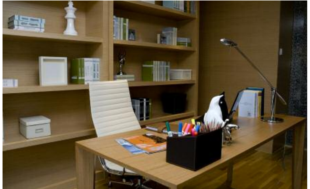
A desk in the commanding position helps strengthen your office's feng shui.

With home offices common in many homes these days, what are the secrets to making a functional, well-designed, and highly creative space for your business? And what are common feng shui mistakes that many Bay Area entrepreneurs make when setting up an office at home?