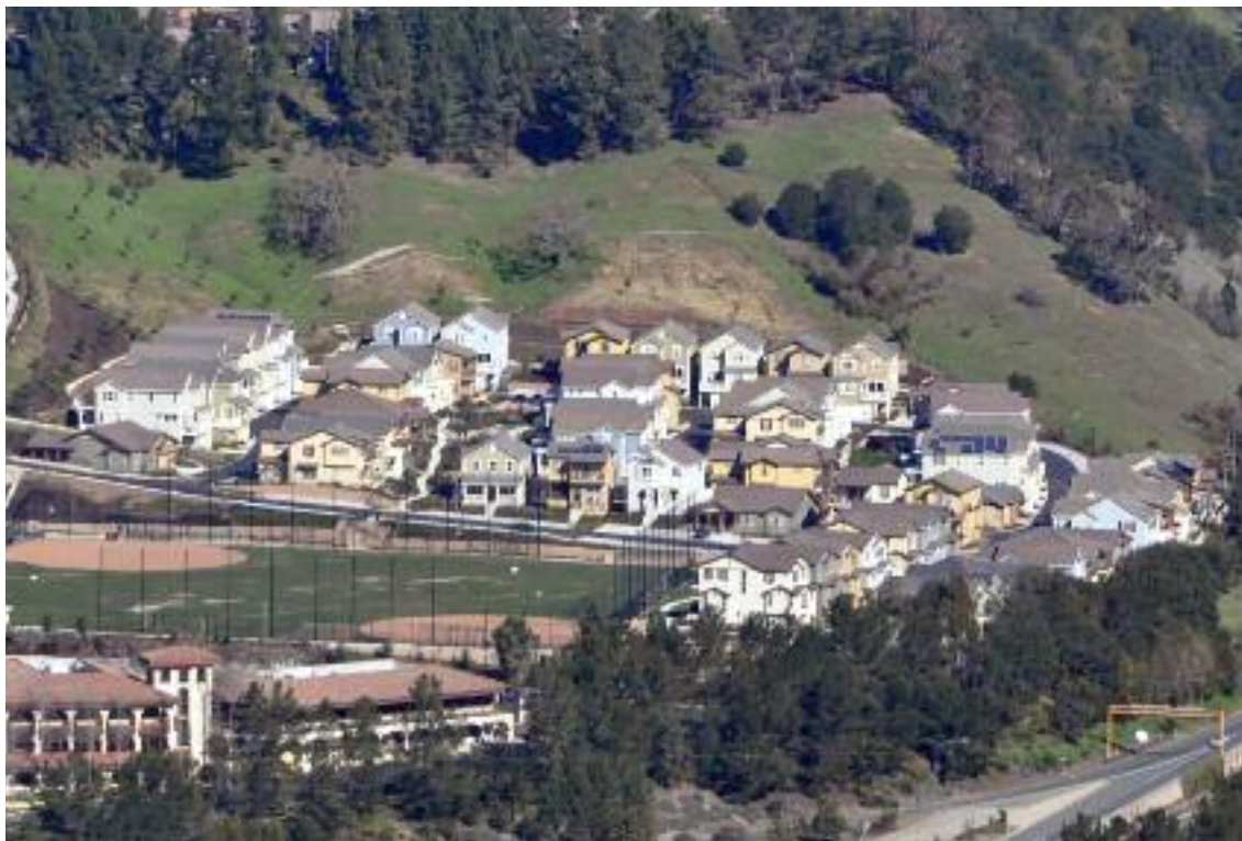
Pulte Homes' Orinda Grove off Altarinda Road