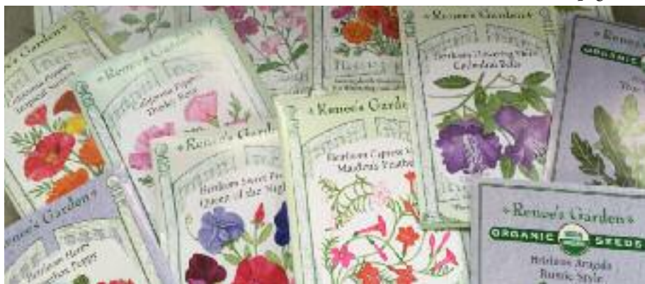
A selection of Renee’s Garden seeds that Cynthia will be planting this spring.