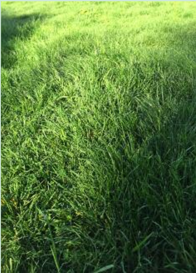
The once-a-month mow grass of Pearl's Premium.