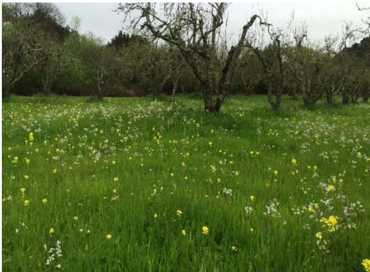
A field of wildflowers in Moraga pear orchard.