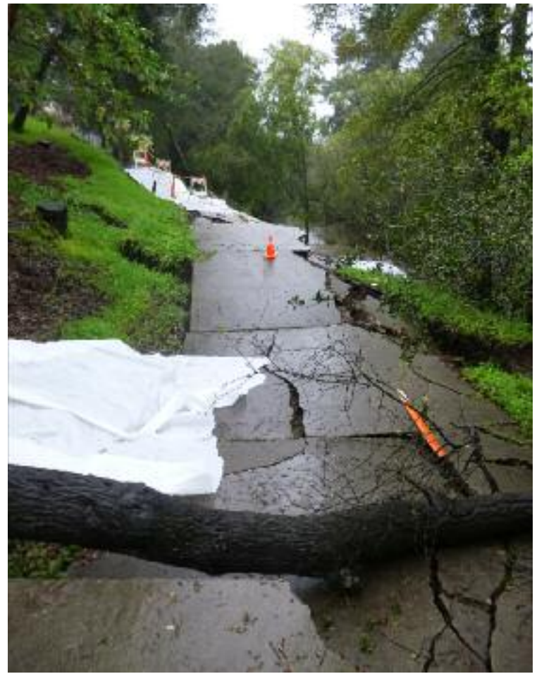
The trail below the country club homes shows damage from the slides.

He adds that typically insurance companies do not cover landslides. A local lawyer who said he'd rather remain anonymous confirmed that no responsibility is involved when it is just Mother Nature doing her thing; only when human-made activities or negligence can be proven can the re-