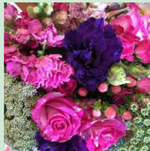
A glorious bouquet of stock, roses, and wild Queen Anne's Lace.