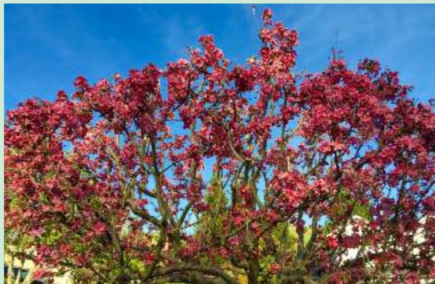
Who can resist the deep rose blossoms of a crab apple tree?