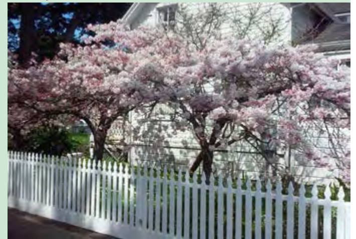
Apple blossoms enhance the white picket fence.