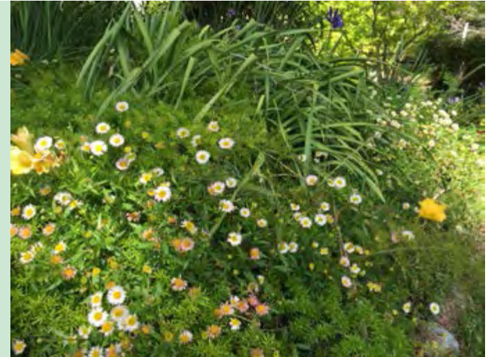
Santa Barbara daisies, Dutch iris, freesia, and asparagus fern share a plot.