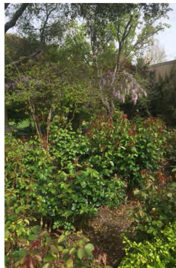
Roses ready to bud