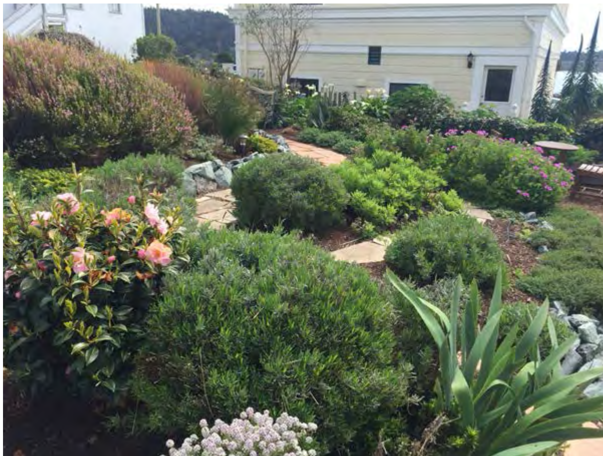
A well-organized spring garden of rhododendron, breath of heaven, bearded iris, alyssum, calla lily, and pelargonium.

“April hath put a spirit of youth in everything.” — William Shakespeare