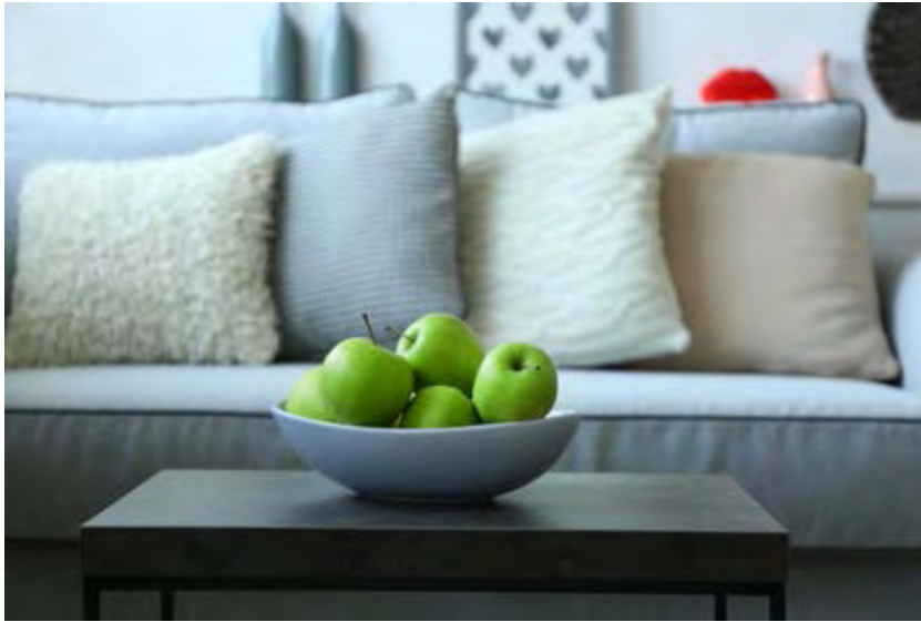
Nubby and tone-on-tone are easy combinations to live with.

In closing, no matter what your space looks like, take time this spring to enjoy your home.