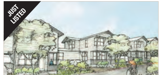
JON WOOD PROPERTIES