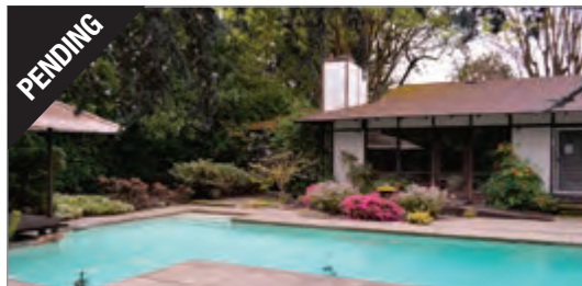
TINA FRECHMAN / JULIE DEL SANTO