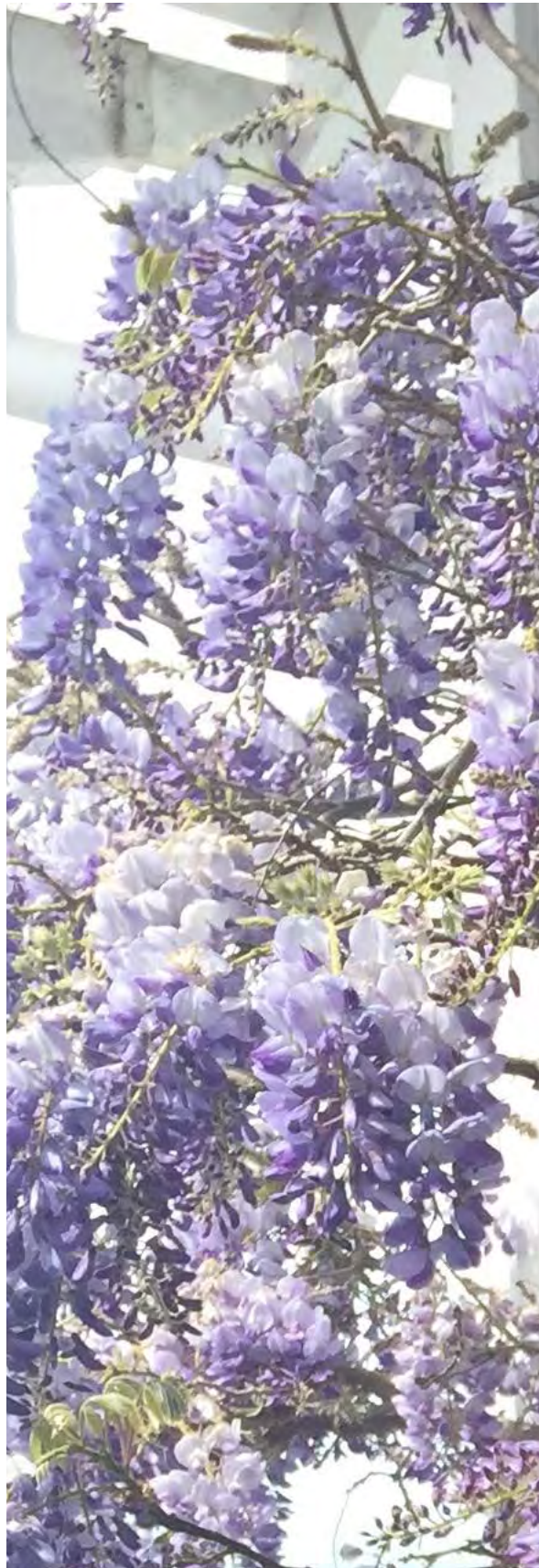
A close up of violet hued wisteria as it encircles a drainpipe.