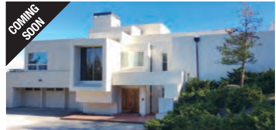
JON WOOD PROPERTIES