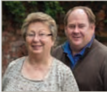
THE CHURCHILL TEAM