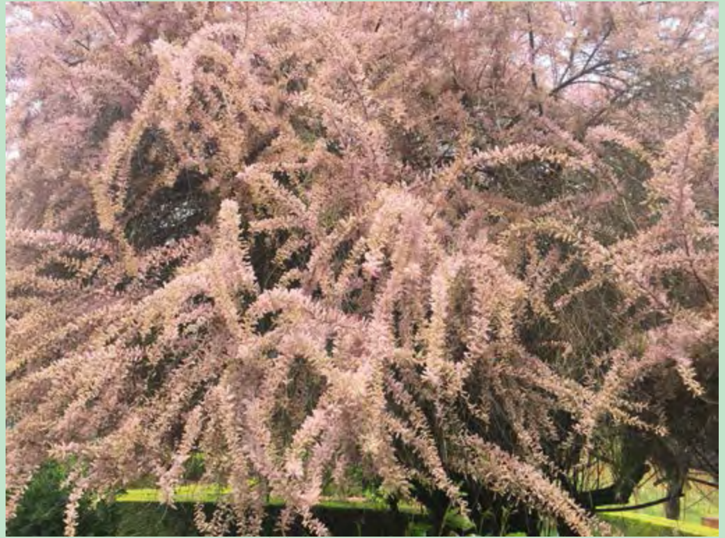
Spectacular smoke tree in its spring wardrobe.