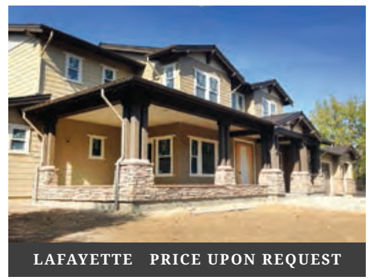
LAFAYETTE PRICE UPON REQUEST