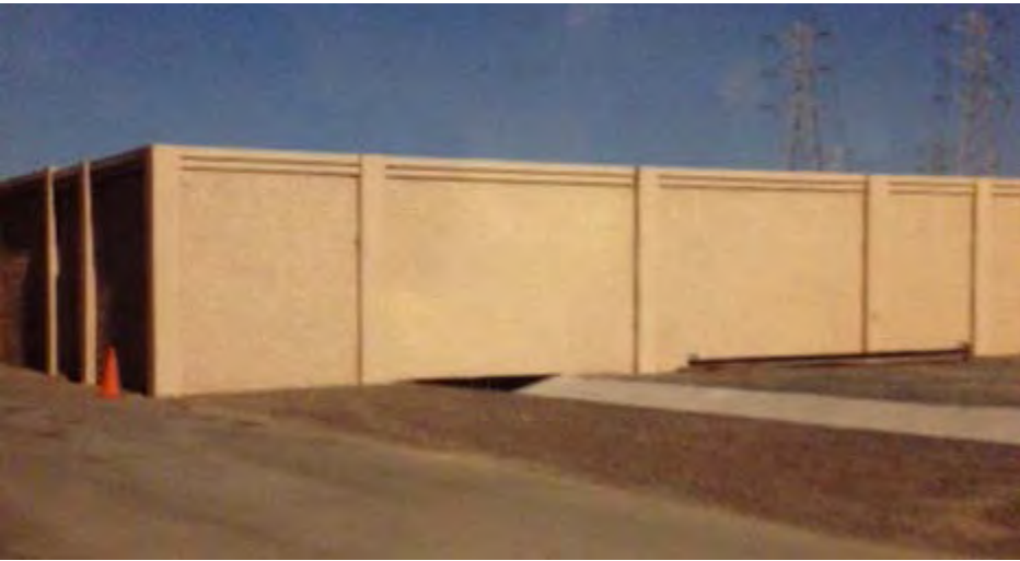
This image of a masonry security wall was presented at the meeting.

Pacific Gas and Electric Company's plans to beef up the physical security around its Moraga Substation in Orinda's Lost Valley neighborhood immediately fired up the neighbors, who are concerned that the work will adversely affect aesthetics, noise and the environment in the area.