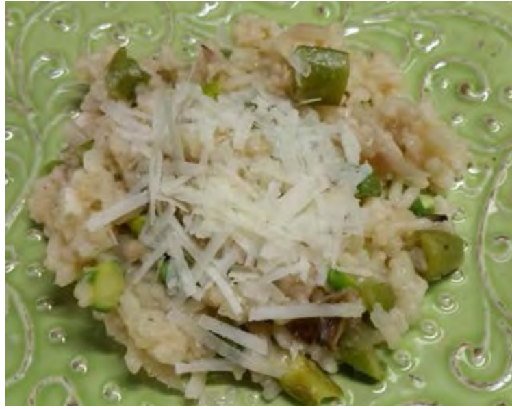
Spring green risotto