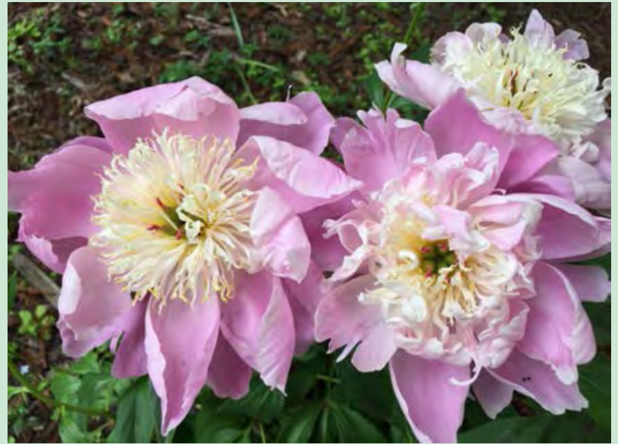
Peonies make fabulous cut flowers.

PULL weeds on a continuous basis. Weeds zap the moisture from the plants we want. Don't let them form seed heads.