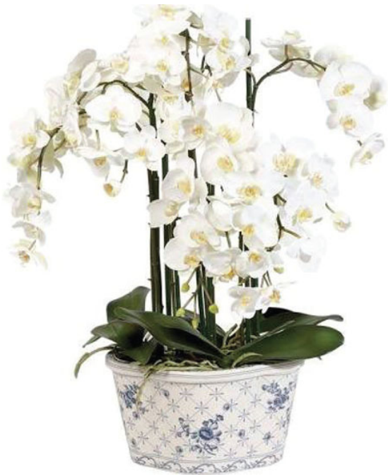
Orchids in a blue and white pot ready to display from Ethan Allen. www.ethanallen.com