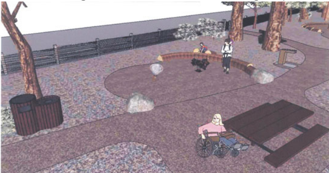
Spinning Cup, Rocking Animal, Log Climb/Balance