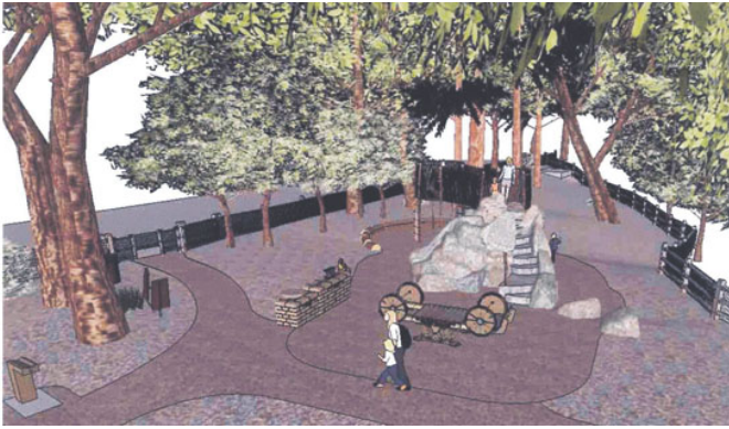
Model view of active play elements: Saklan Climbing Rock/Platform, Cargo Net Hammock, Slide, Pioneer Wagon, Pioneer Store. Images provided