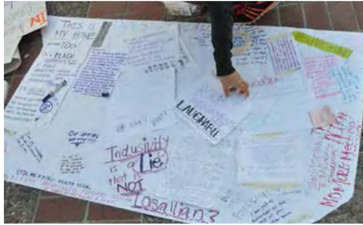
Students wrote their messages on butcherpaper.

developing a policy for the retention of underrepresented faculty; requiring that all students take a diversity course; requiring that public safety improve their relations and stop persecuting students of color; and creating an annual plan of action about how the college will improve the experience of marginalized students.