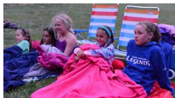
Last year at the Movies in the Park

Families are encouraged to bring blankets, lawn chairs and picnics. For more information on both these ongoing events call (925) 254-2445 or visit the city's website at www.cityoforinda.org .