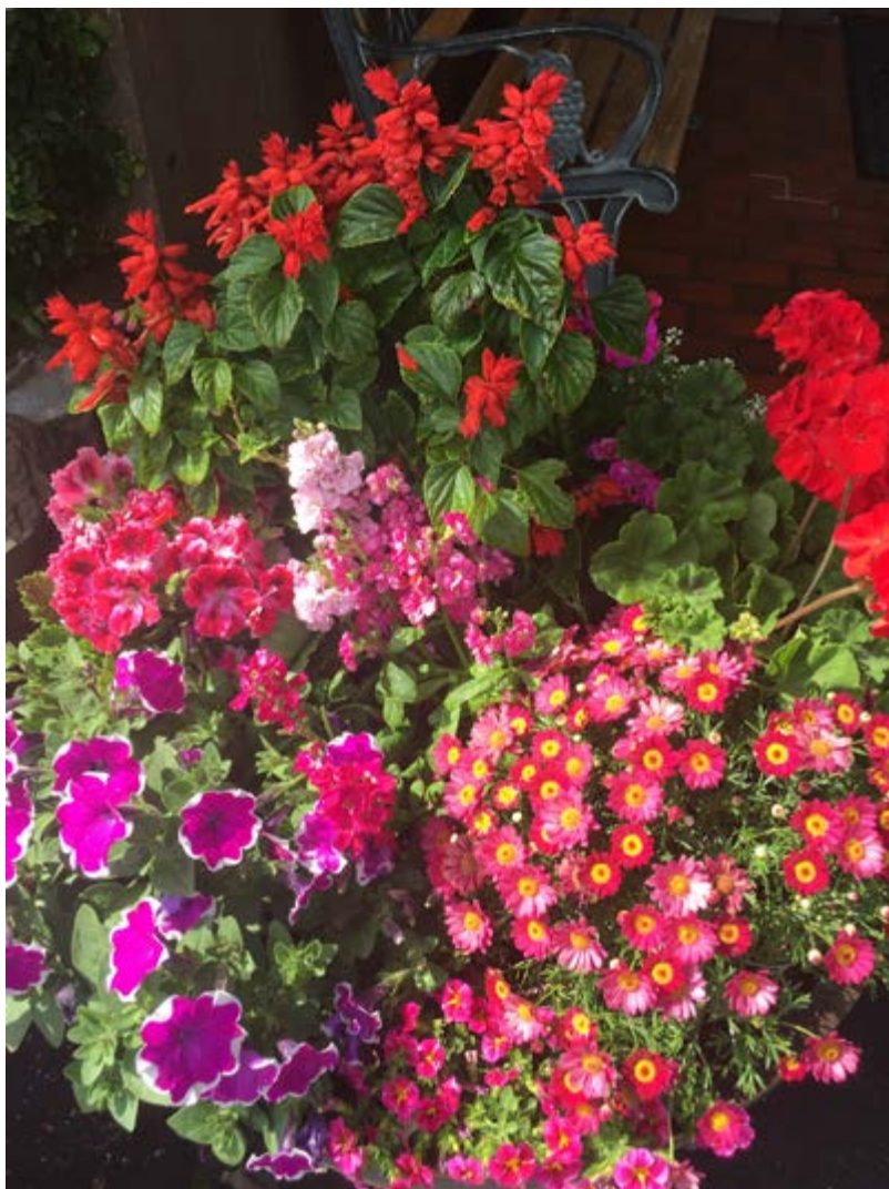
Park a container of salvia, petunia, pelargonium, geranium, and other heat lovers next to a bench.

“It’s better to be absolutely ridiculous than absolutely boring.” — Marilyn Monroe