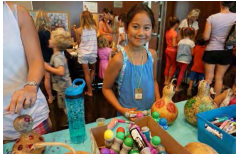
Decorating musical gourds was part of the fun at the MakerFest.

Hours: Mon-Fri 9am-9pm • Sat 8am-7pm • Sun 8am-7pm