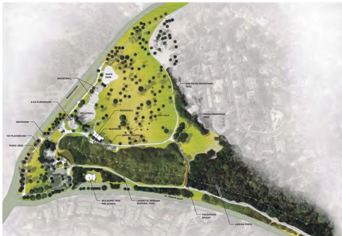
A map of the Moraga Commons Park Master Plan - existing conditions.

The Parks and recreation department is preparing a master plan for Moraga Commons Park.