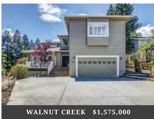
WALNUT CREEK $1,575,000

507 Winchester Court | 5bd/3.5ba L. Brydon/K. Ives/K. Brickman | 925.258.1111