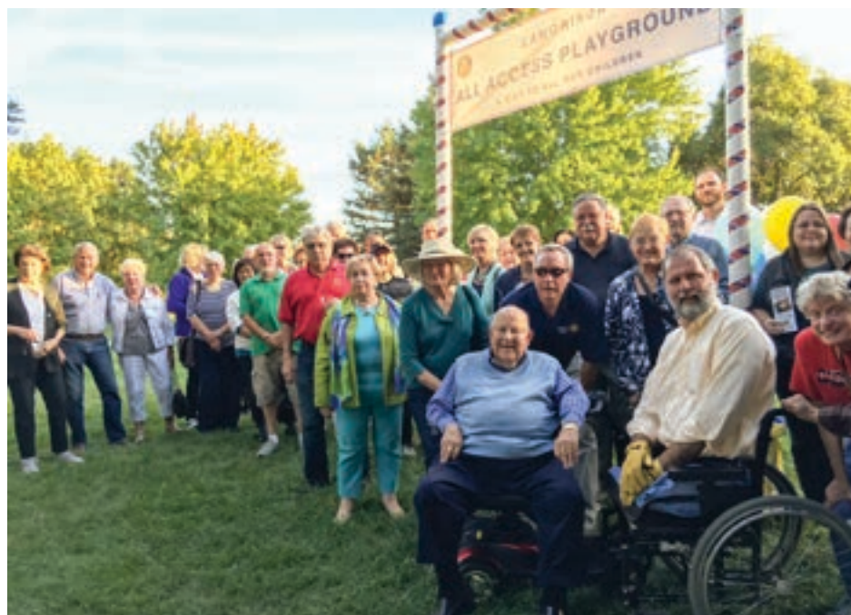
A gathering of well-wishers kick off fundraising for the All-access Playground to be installed at Moraga Commons.