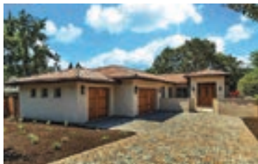
LAFAYETTE $2,595,000 5/4.5 Coveted Trails neighborhood. Beautiful open floor plan, park like setting. A 10! The Beaubelle Group CalBRE #00678426