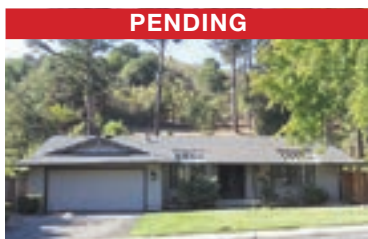
MORAGA $1,195,000 3/2 One-story Campolindo Home with large, private yard with pool. 3 bedrooms plus office. The Holcenberg Team CalBRE #01373412

5 Moraga Way | Orinda | 925.253.4600 | 2 Theatre Square, Suite 117 | Orinda | 925.253.6300