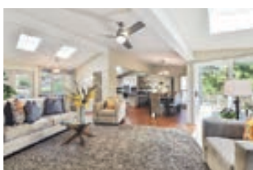
ORINDA $1,295,000 6/3.5 Spacious contemporary home with updates throughout & au pair unit. Level yard area. Meredith Linamen CalBRE #01918299