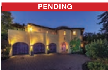
ORINDA $2,775,000 4/3.5 Exquisite 4095sf Mediterranean estate w/750sf 1bd 1bth guest cottage built in 2008. Lynn Molloy CalBRE #01910108