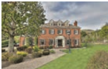
MORAGA $2,595,000 5/4.5 Exciting & prestigious in Sanders Ranch. 4525 sqft, stunning kitchen, lovely garden w/pool! Elena Hood CalBRE #01221247