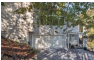
LAFAYETTE $880,000 3/2 Beautifully designed Custom Contemporary home w/open floor plan and scenic hillside views. Laura Abrams CalBRE #01272382