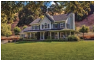
BRIONES - MARTINEZ $1,895,000 4/2.5 Magnificent Country Estate Built 2006, the perfect mix: equestrian facility/home/grounds. Abrams|Geoffrion CalBRE #01272382|01878803