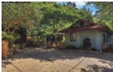
ORINDA $1,875,000 6/6 Exquisite Orinda Country Club retreat w/private au-pair/in-law quarters. Spacious thru-out Laura Abrams CalBRE #01272382