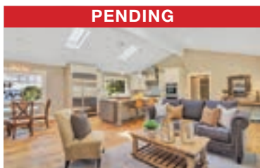
ORINDA $1,875,000 4/3.5 Fantastic remodeled ranch home. Vaulted ceilings, great room opens to patios & level lawn. Rick & Nancy Booth CalBRE #01388020|01341390