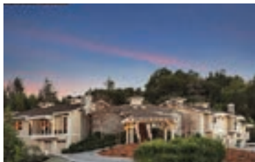
ORINDA $4,250,000 6/5.5 8+ acres w/potential for subdivision. Recently updated with many features. One of a kind!! Laura Abrams CalBRE #01272382