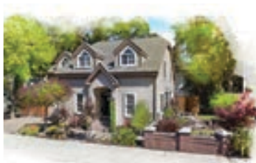
LAFAYETTE $1,495,000 4/3 Stately Traditional boasts a FAB remodel & a location 1 block from downtown Lafayette. Patti Camras CalBRE #01156248