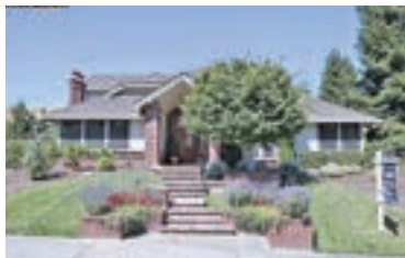
MORAGA $2,099,990 5/3 Lovely 3730 sqft, updated kitchen & baths, private master, .30 acre lot w/pool & spa. Elena Hood CalBRE #01221247