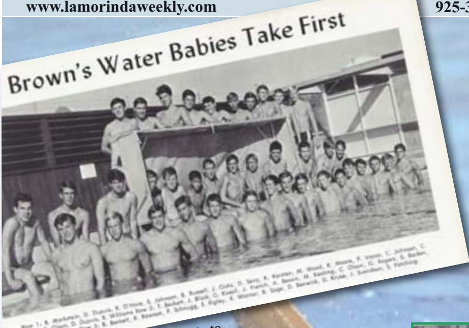
1967 Polo Year Book team year book photo