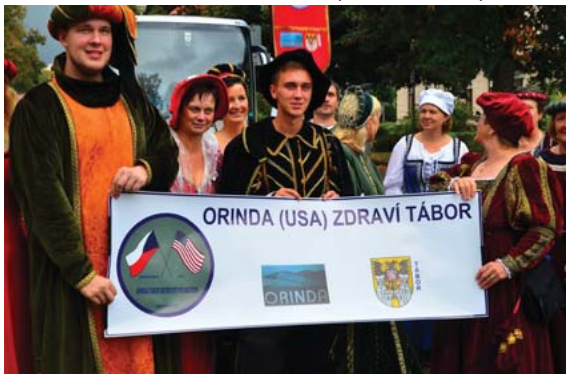
A parade helped honor Orinda's delegation.